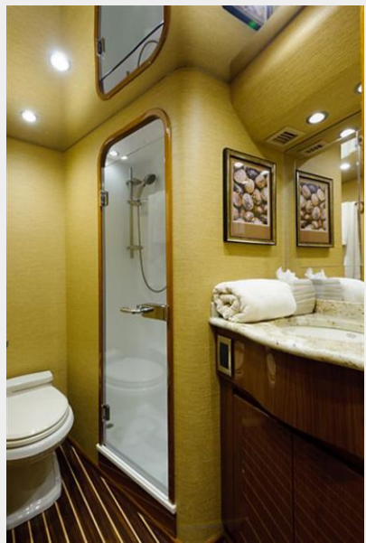
Guest Head, Port