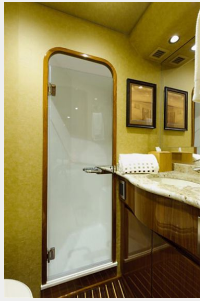
Guest Head, Starboard