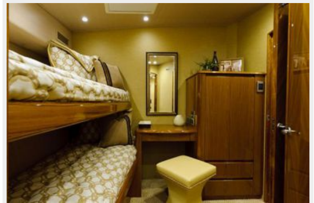
Guest Stateroom, Port