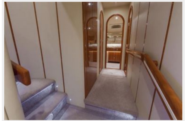
Companionway Looking Forward