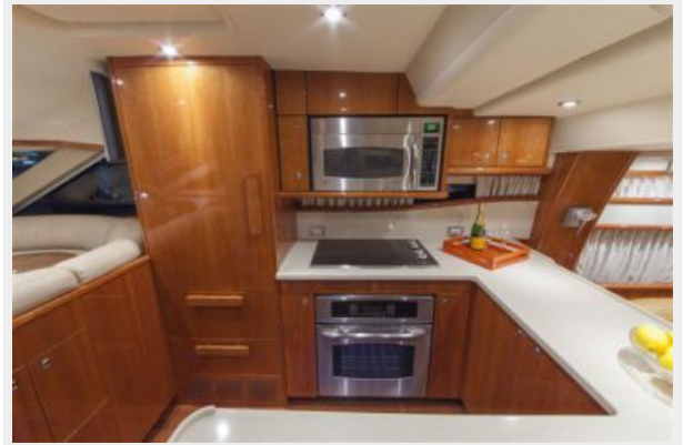
Full Size Fridge & Oven