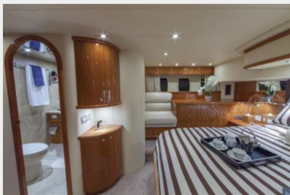
Master Looking to Starboard