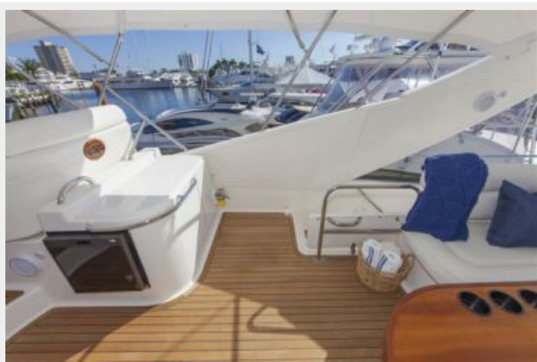
Flybridge Looking Starboard