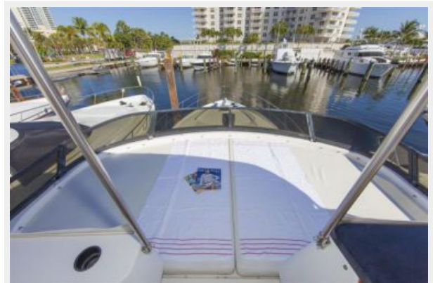
Sun Lounge Forward of Helm