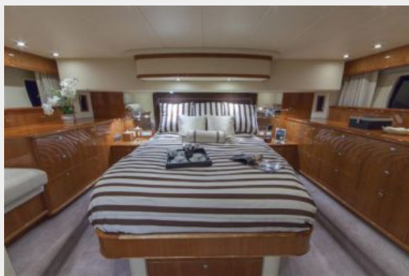
Master Looking Aft