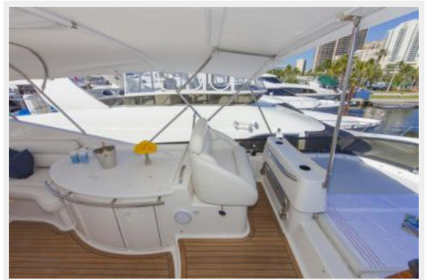
Flybridge Companion Seat