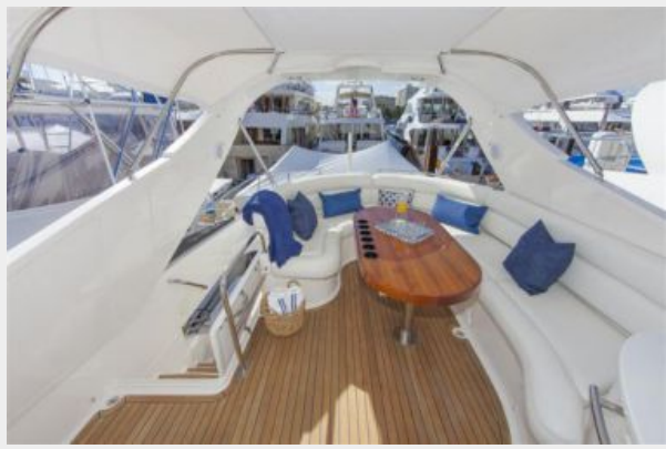
Flybridge Looking Aft