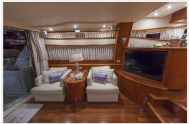
Salon Looking to Port