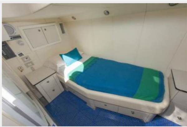
Crew Looking to Port