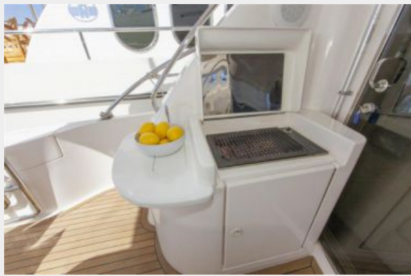
Aft Deck Grill