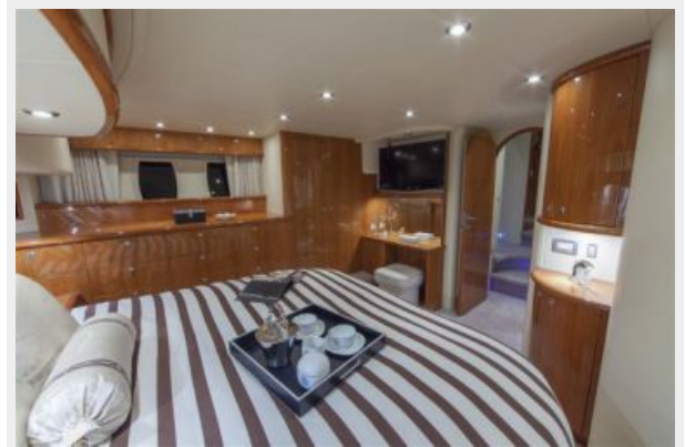
Master Looking to Port