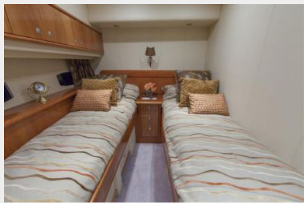
Starboard Guest Cabin