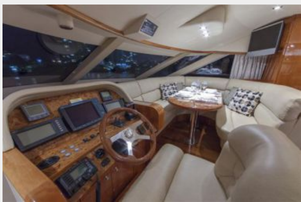
Dinette to Starboard