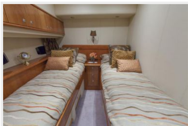
Starboard Guest Cabin