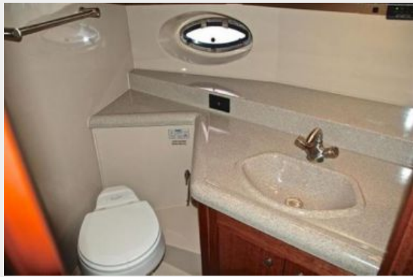
VIP ENSUITE HEAD