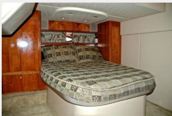
MASTER STATEROOM VIEW 1