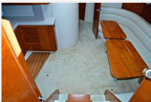
CABIN ENTRY STEPS