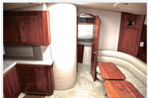
CABIN FWD VIEW