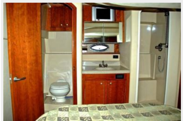
MASTER STATEROOM VIEW 2