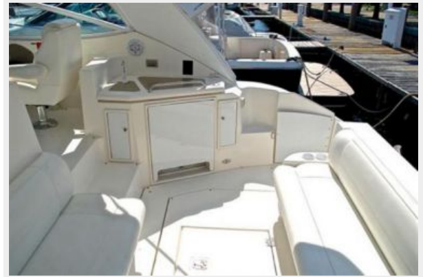
COCKPIT WET BAR