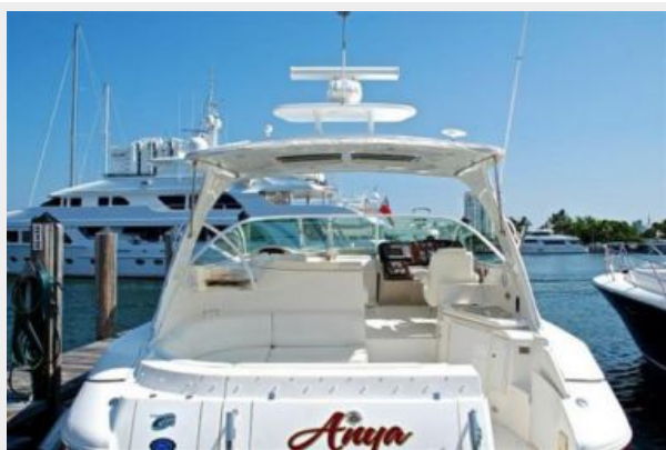
COCKPIT VIEW 1