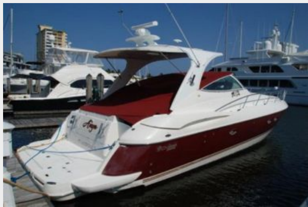
VESSEL STBD VIEW