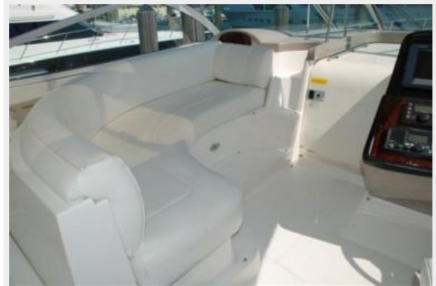
CABIN ENTRY DOOR