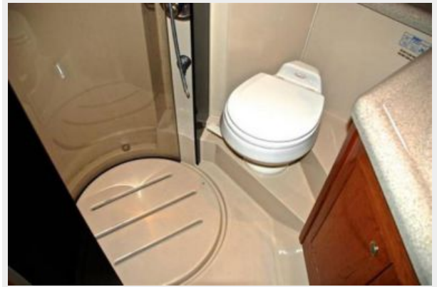
VIP ENSUITE SHOWER