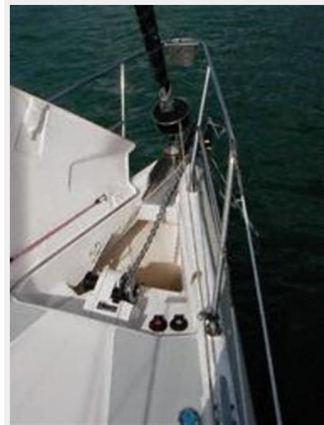
Anchor locker and windlass