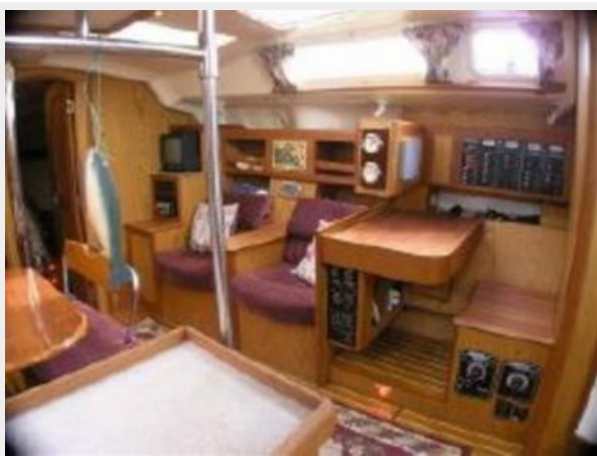
Main Cabin - Starboard