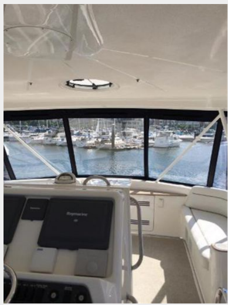
Bridge View Looking Forward