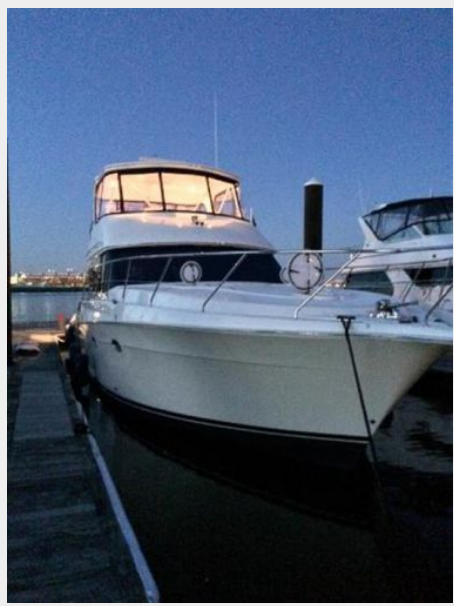
Forward View From Dock