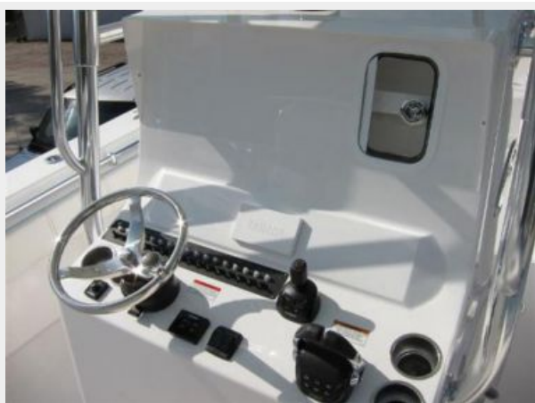
Helm w/ Joystick control