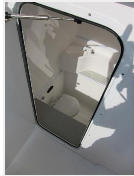
Head in console