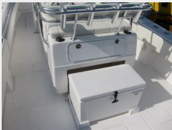
Slid out cooler