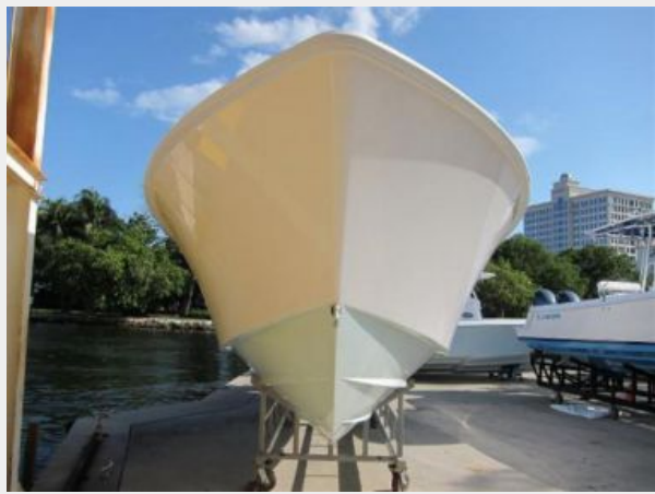
35 Contender ST