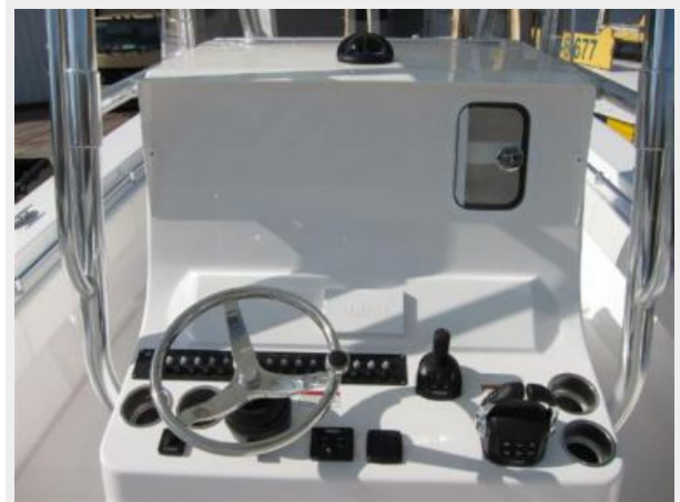
Helm w/ Yamaha Joystick control