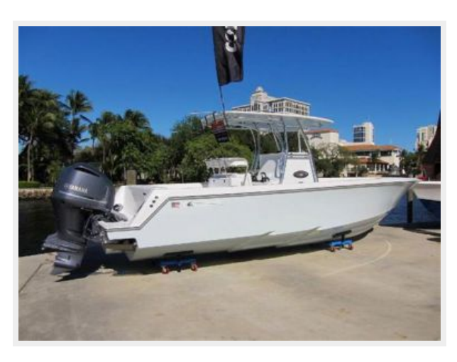
Contender 30 ST