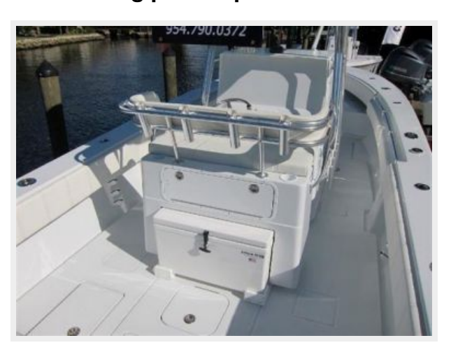
Leaning post w/ pull out cooler