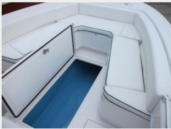
Insulated Fish Box