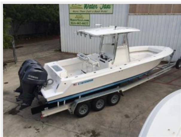
Contender 28 Sport