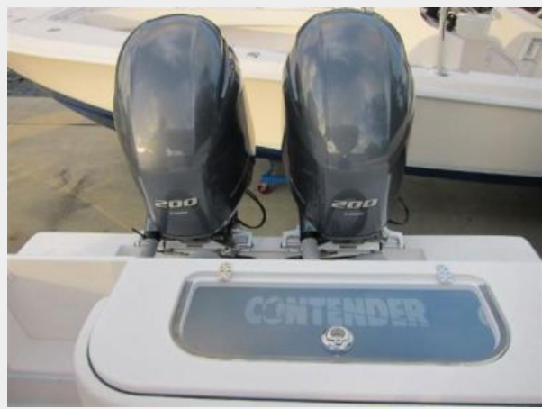
Livewell, Twin 200 Yamaha Four Strokes