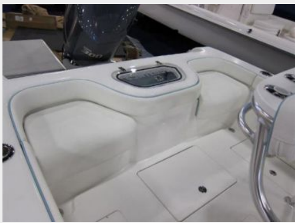
Transom live well and jumpseats