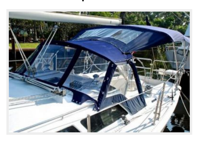
Cockpit Fwd View