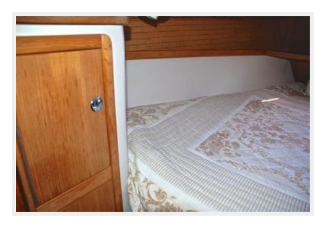
Fwd Cabin Hanging Closet