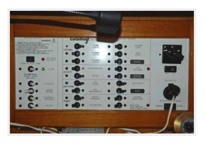
Main Breaker Panel