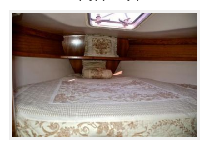
Fwd Cabin Berth