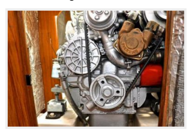
Engine Fwd View