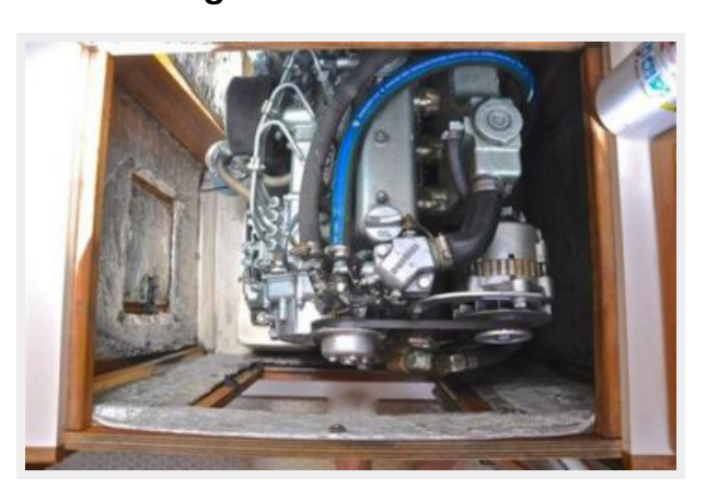
Engine Overhead View