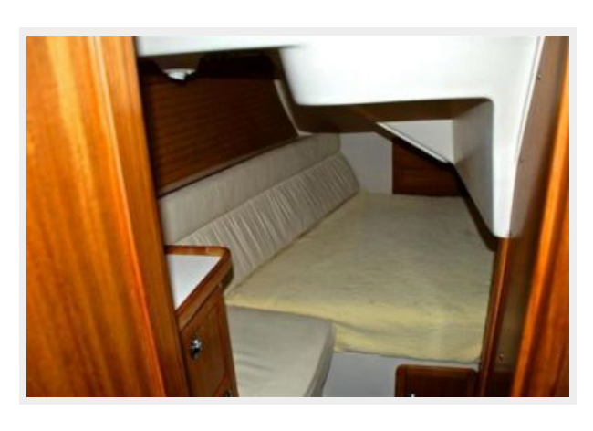
Aft Cabin Entrance