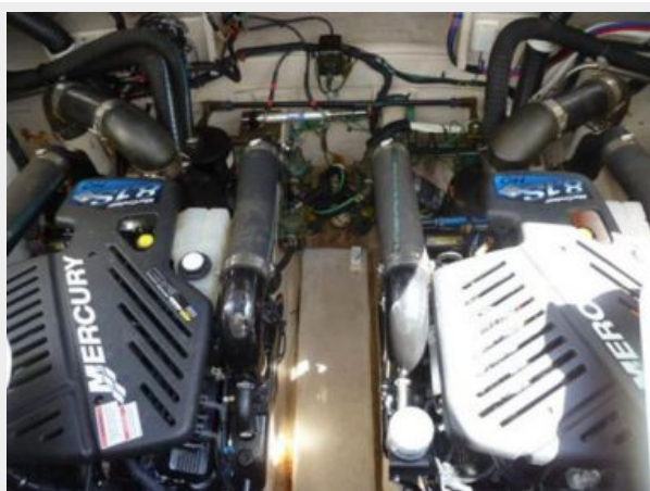
Clean Engine room