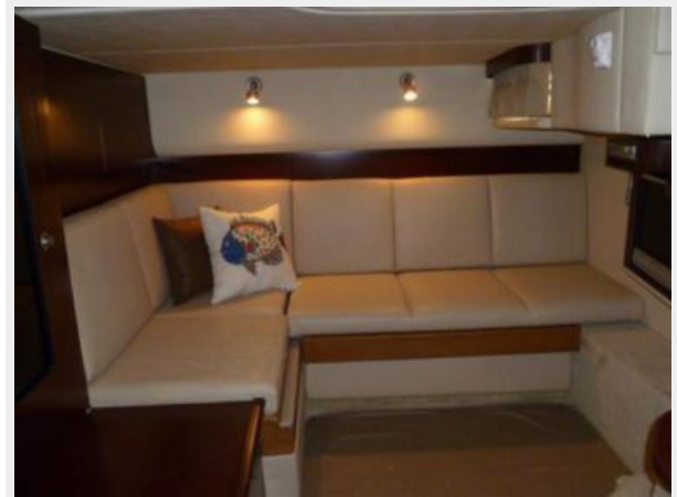
Midcabin Sofa sleeper