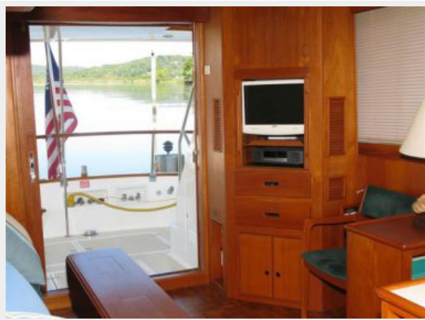
Corner Entertainment Center