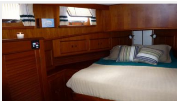
Master Cabin Storage