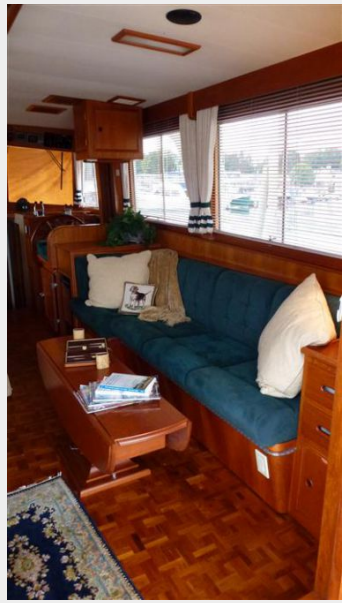
Salon Starboard Settee