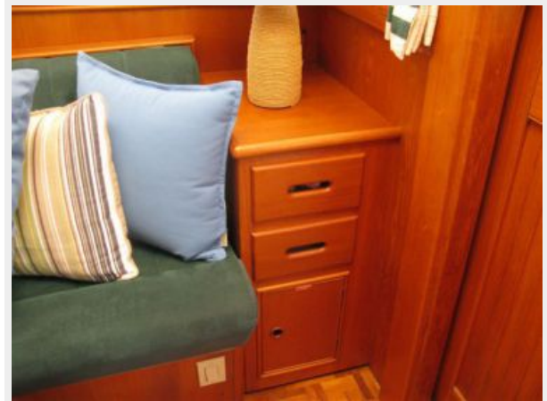
End Table With Drawers