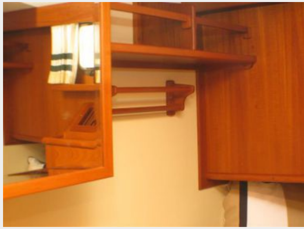
Guest Cabin Book Rack