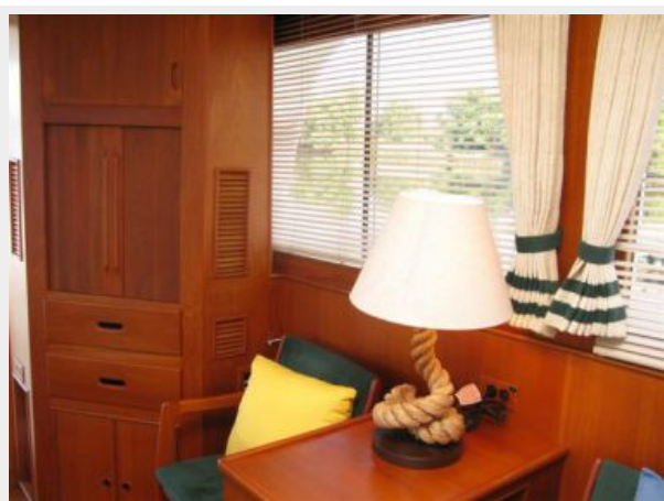
TV Tambor Door