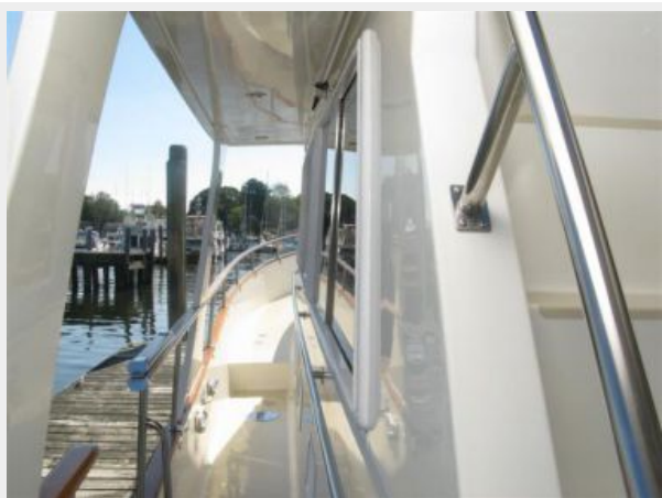
Port Side Deck