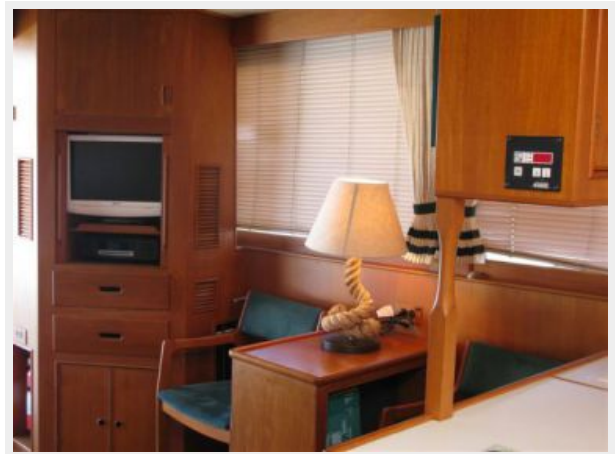
Salon Port Seating