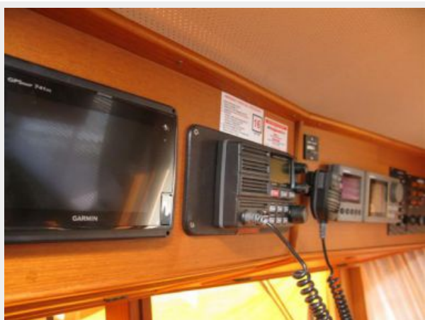
Lower Helm Console