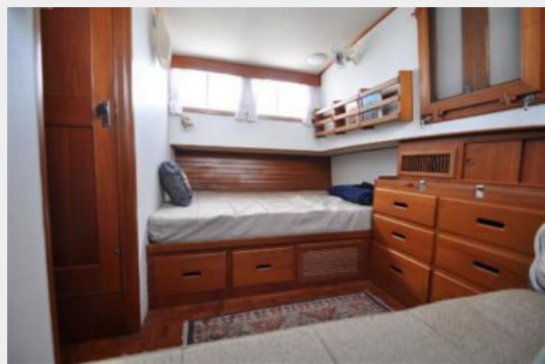
master double berth