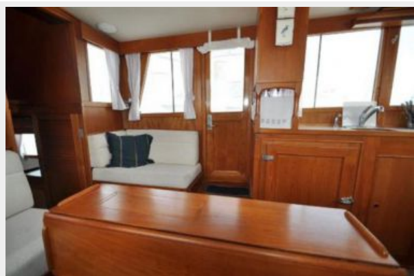
main saloon port side