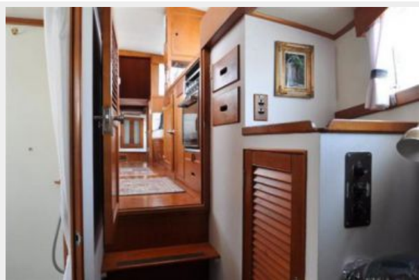
looking aft from the bow cabin