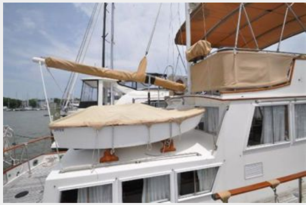
Dyer (dock box)