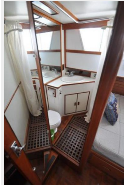
master head & shower