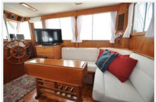
main saloon dinette starboard side