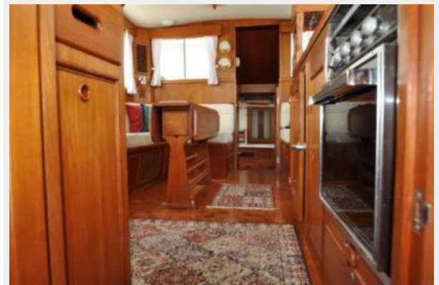
main saloon/galley looking aft