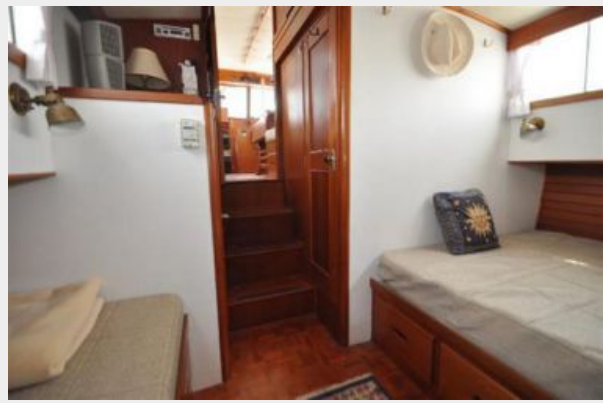
master stateroom looking forward