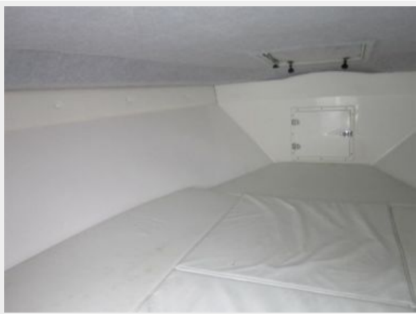
Cuddy Cabin Port