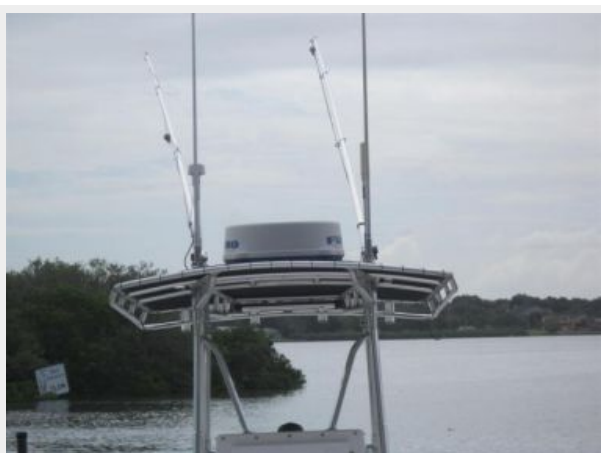
T Top Radar