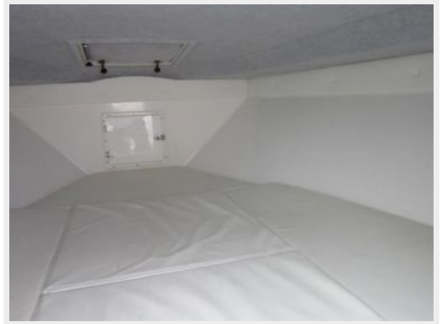
Cuddy Cabin Stbd