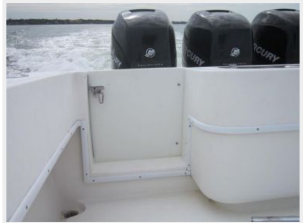
Dive Door to Transom