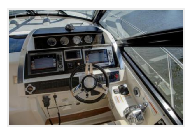
Helm Electronics (2)