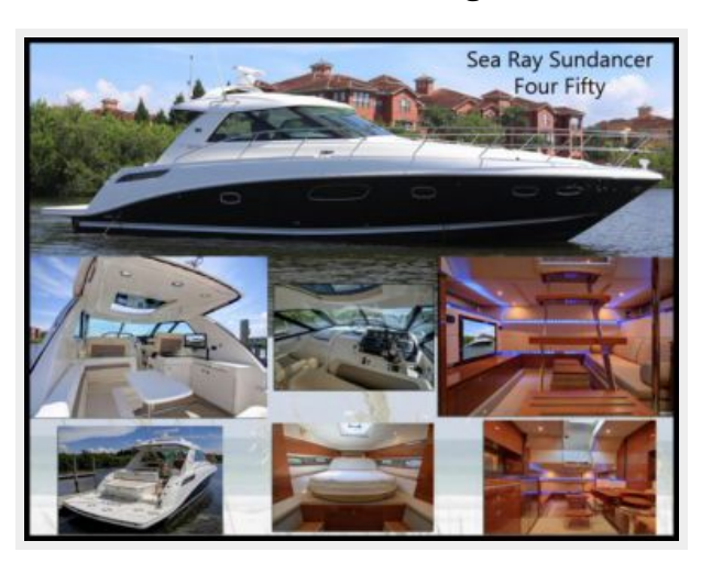
Our Trade Collage