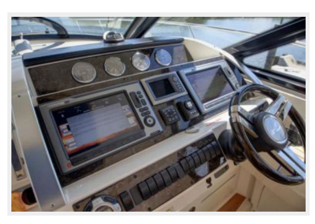
Helm Electronics (1)