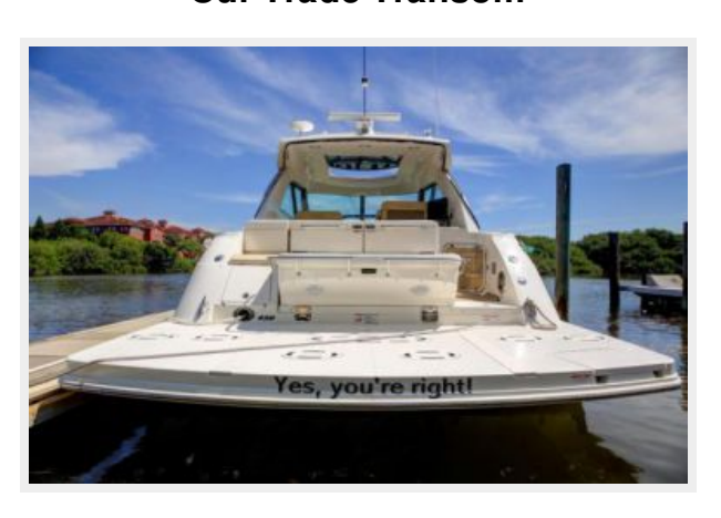
Our Trade Transom