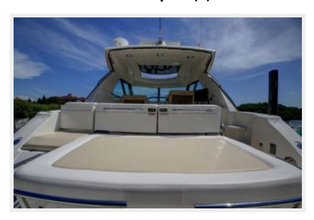
Aft Sunpad (1)