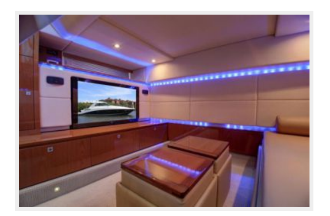
Master / Forward Stateroom