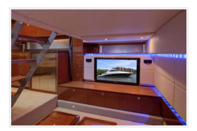
Mid Stateroom / Media Room TV To Starboard