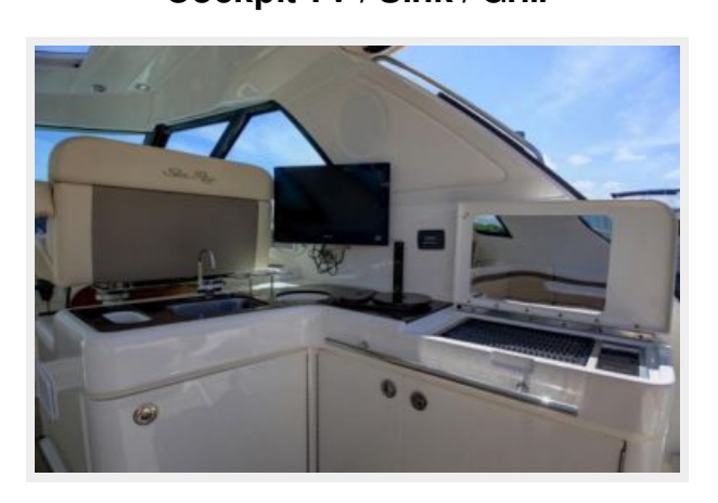
Cockpit TV / Sink / Grill