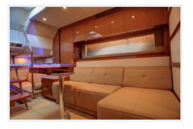
Salon Sofa To Port