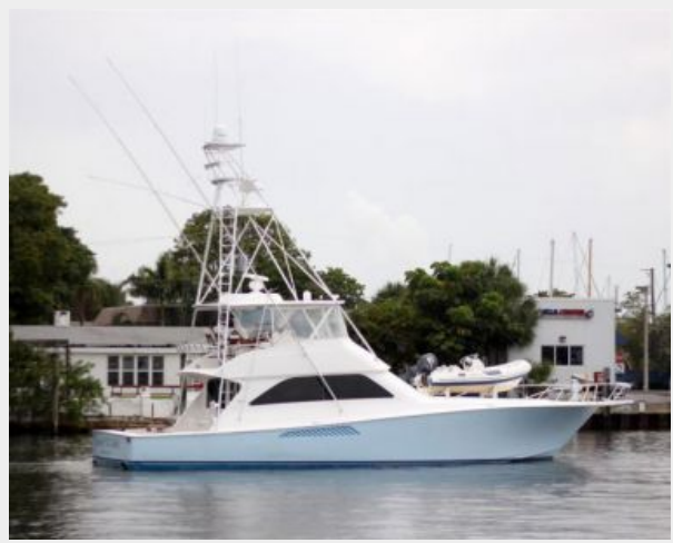
Profil - Starboard side