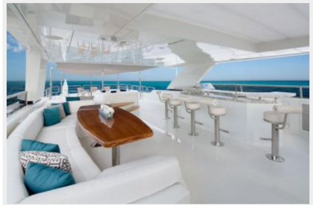
Ocean Alexander 100'