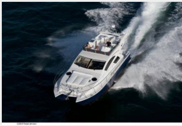
Running - Forward View