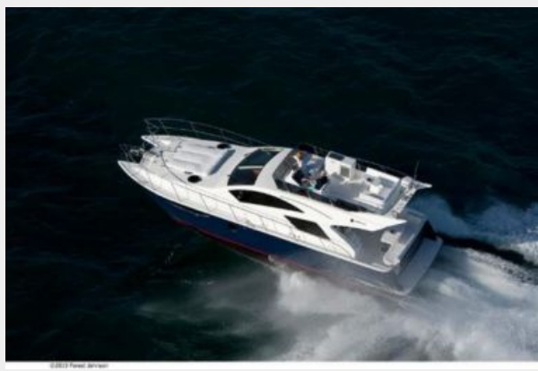
Running - Port View