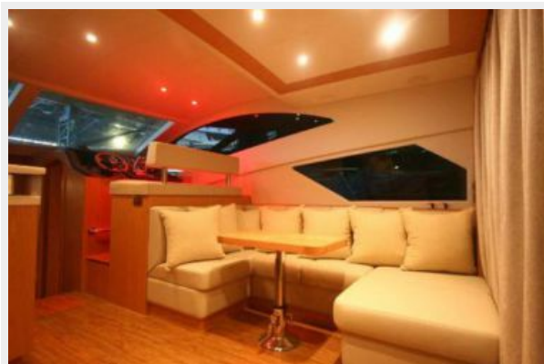
Salon seating starboard