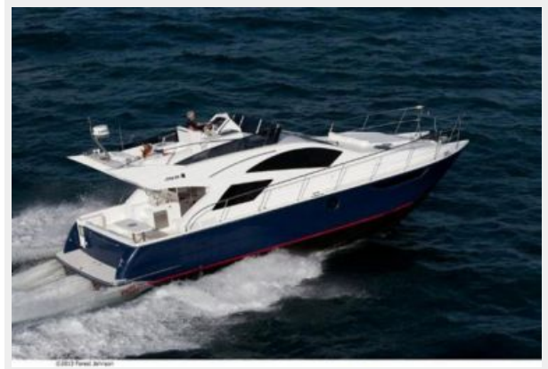
Running - Starboard View