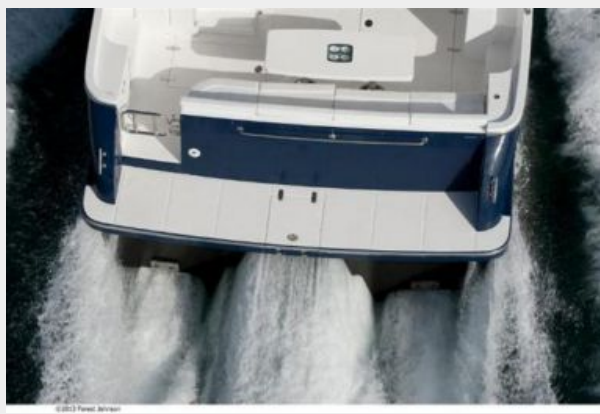
Running - Transom View