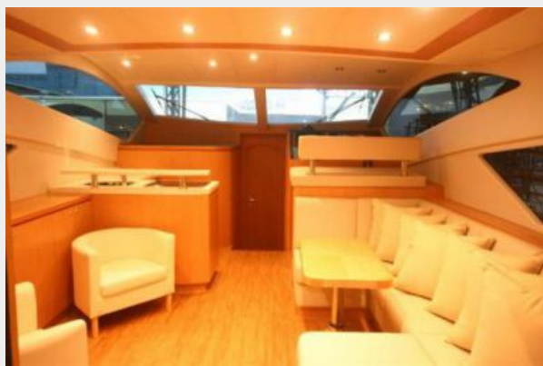
Salon looking forward