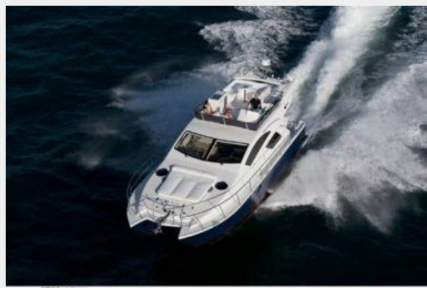
Running - Forward View