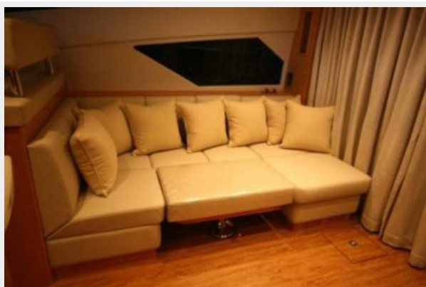
Salon seating/additional sleeping area