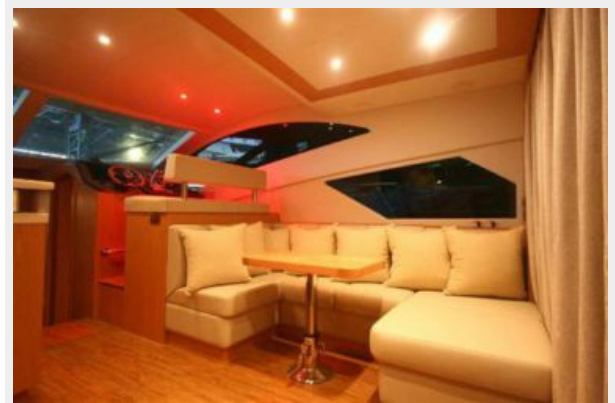
Salon seating starboard