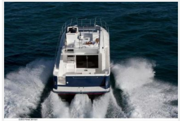
Running - Aft View