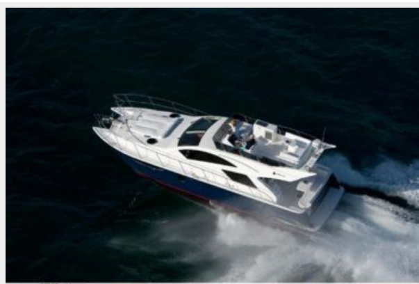
Running - Port View