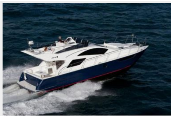
Running - Starboard View