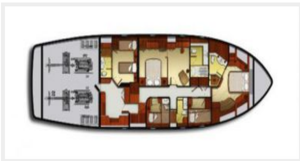
Lower Deck (customization available)