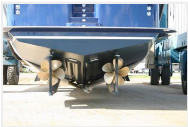
Running Gear (sister-ship)