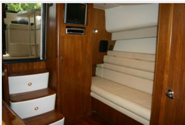
Port Side Settee