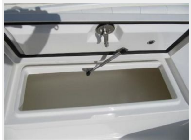
Starboard Forward Dry Storage