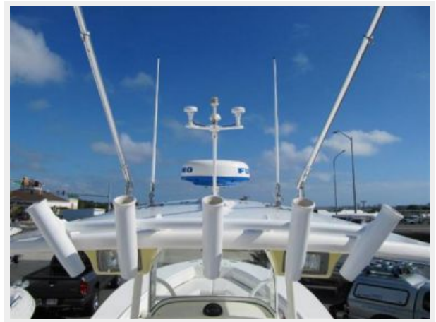
Hardtop Rocket Launcher / Antennas