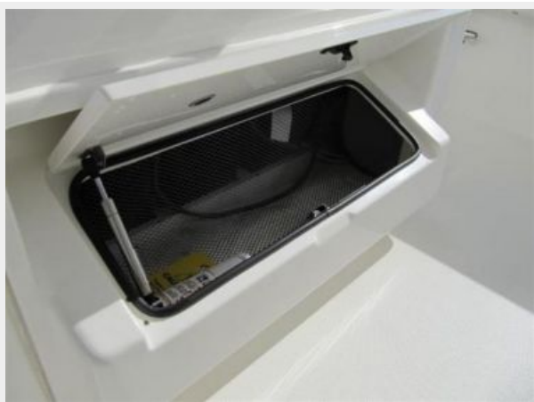
Battery Access / Storage