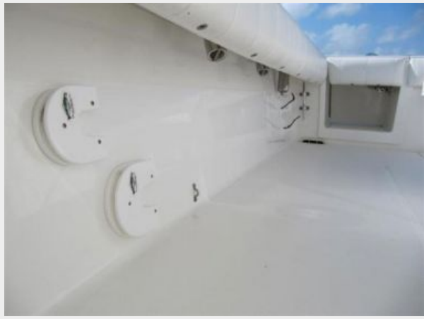
Starboard Under Gunwale