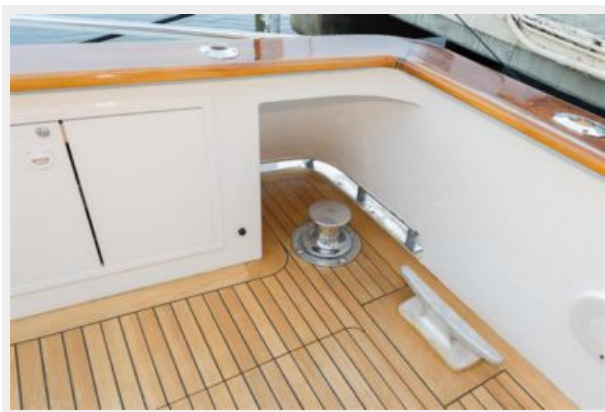
New Teak Decks