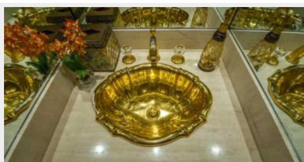
Gold Plated Sink