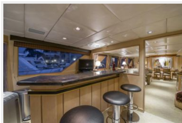
Aft Deck Bar