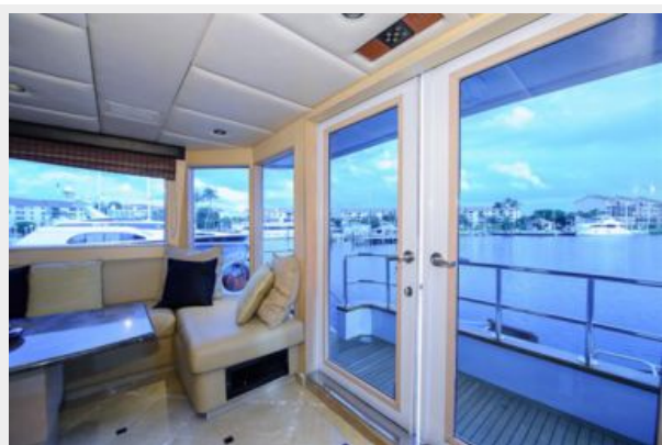
Large Aft Deck Windows