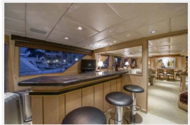
Aft Deck Bar