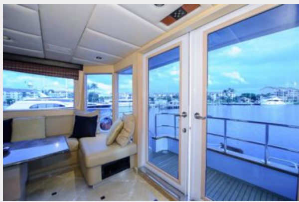
Large Aft Deck Windows