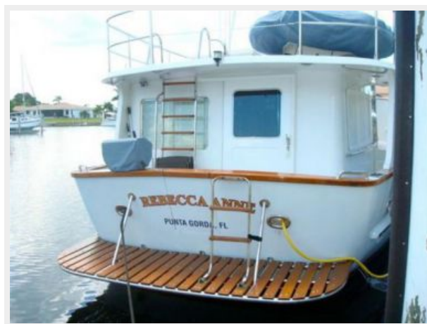
46' Nordhavn aft profile