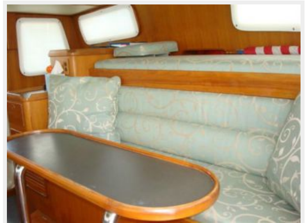
46' Nordhavn pilothouse seating photo2