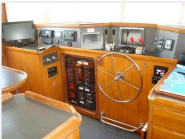
46' Nordhavn pilothouse helm photo2