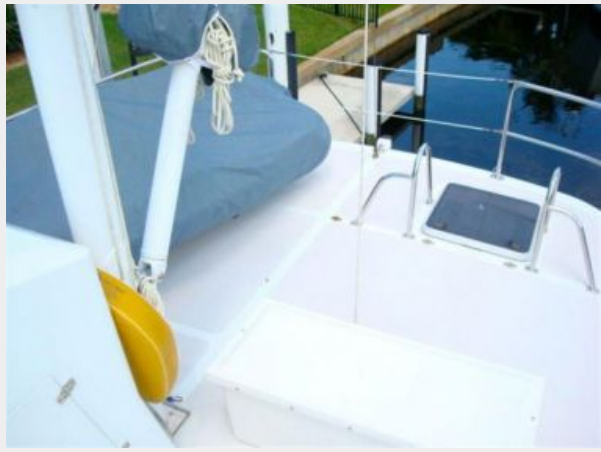
46' Nordhavn flybridge