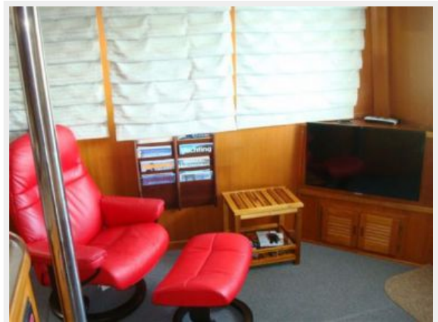
46' Nordhavn salon starboard