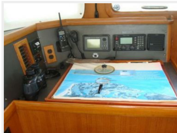
46' Nordhavn pilothouse chart table