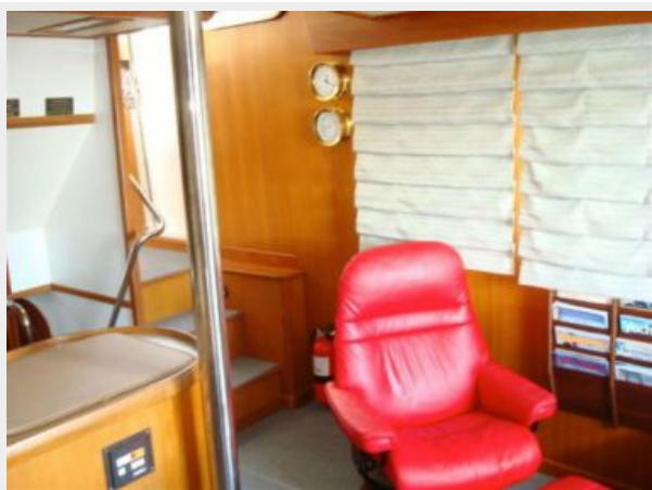
46' Nordhavn salon starboard forward