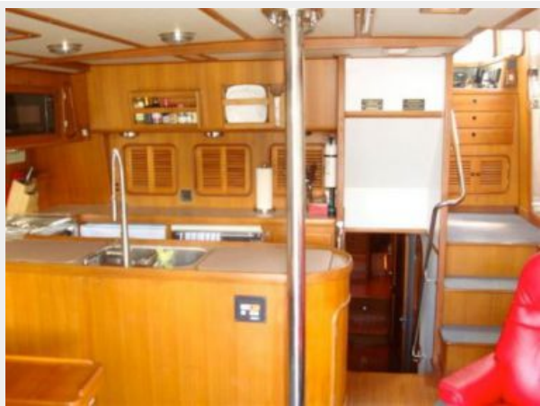
46' Nordhavn salon forward