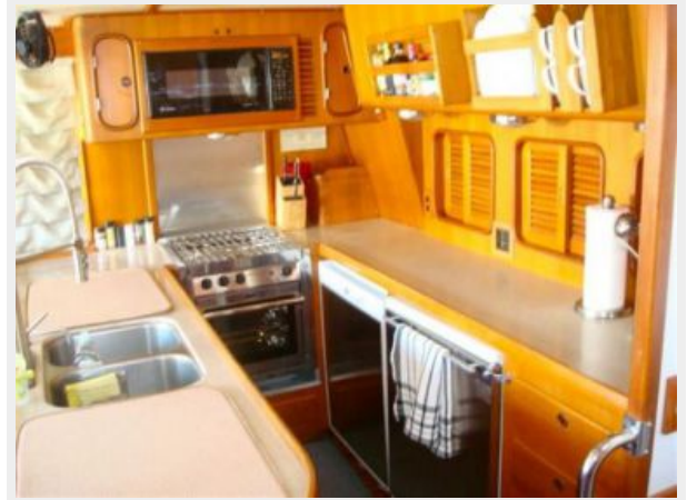
46' Nordhavn galley photo2