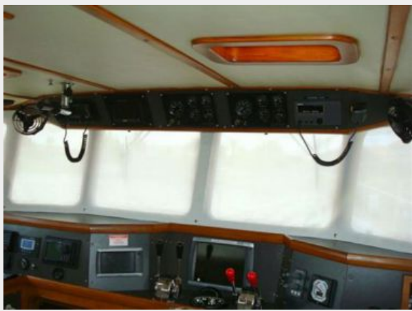
46' Nordhavn pilothouse forward