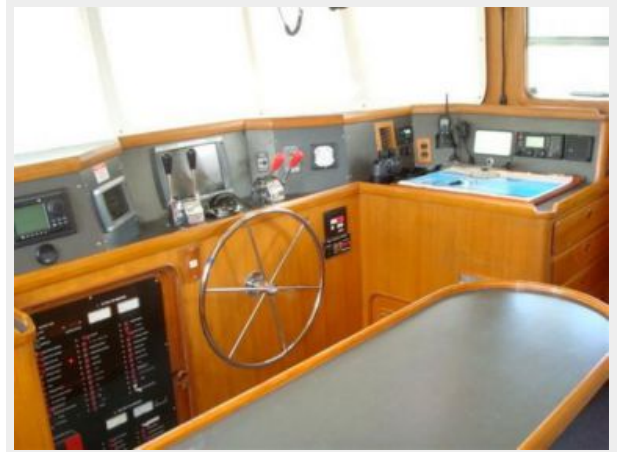
46' Nordhavn pilothouse helm photo1