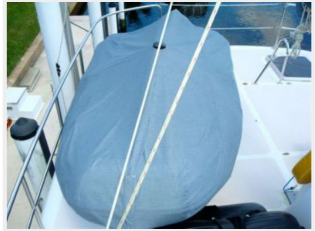
46' Nordhavn tender