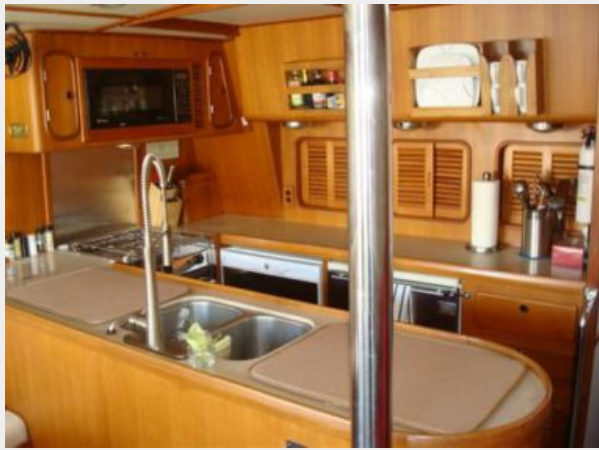
46' Nordhavn galley photo1