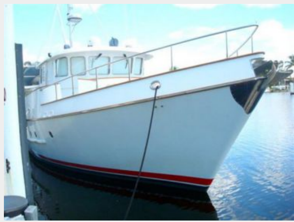
46' Nordhavn starboard forward profile