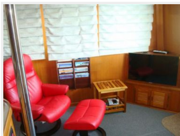
46' Nordhavn salon starboard