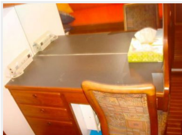
46' Nordhavn guest stateroom desk