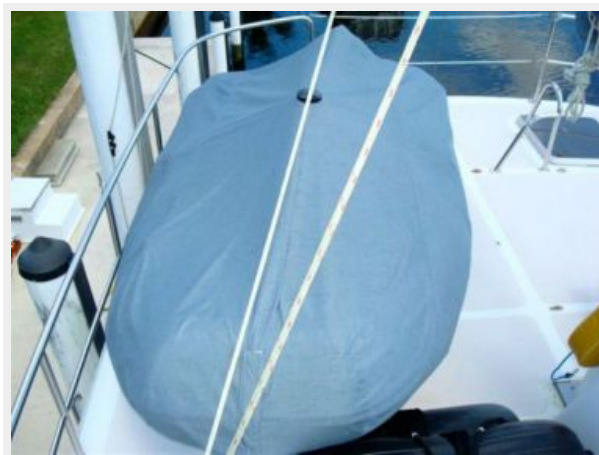
46' Nordhavn tender