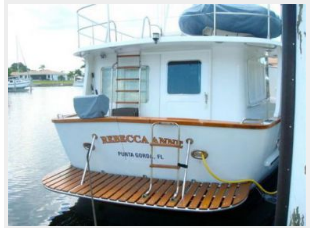
46' Nordhavn aft profile