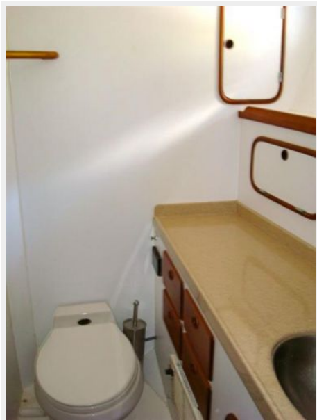
46' Nordhavn master stateroom head