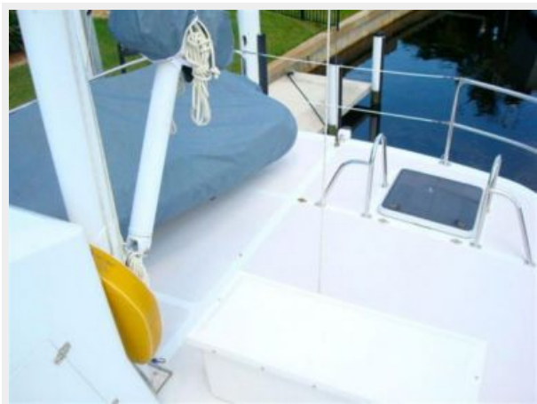
46' Nordhavn flybridge