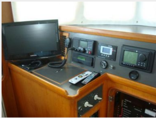
46' Nordhavn pilothouse helm photo4