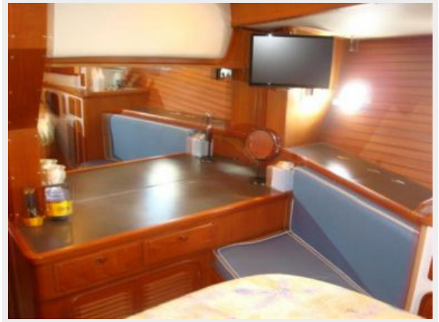
46' Nordhavn master stateroom vanity