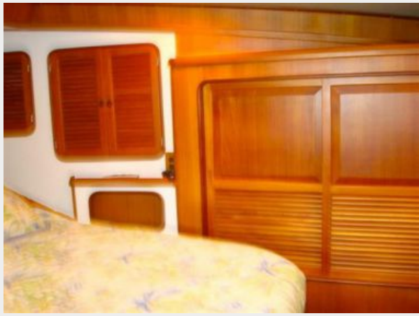
46' Nordhavn master stateroom starboard