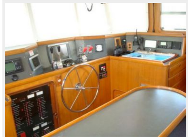
46' Nordhavn pilothouse helm photo1