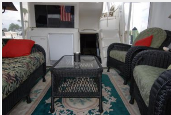
Aft Deck facing Forward