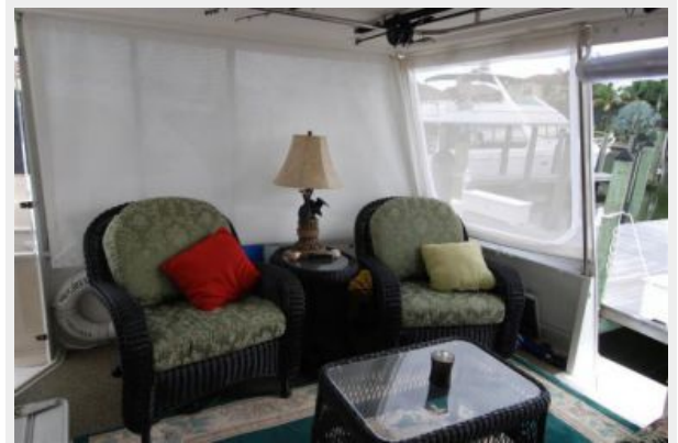
Aft Deck Strb side