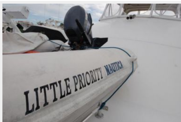
Dinghy on bow