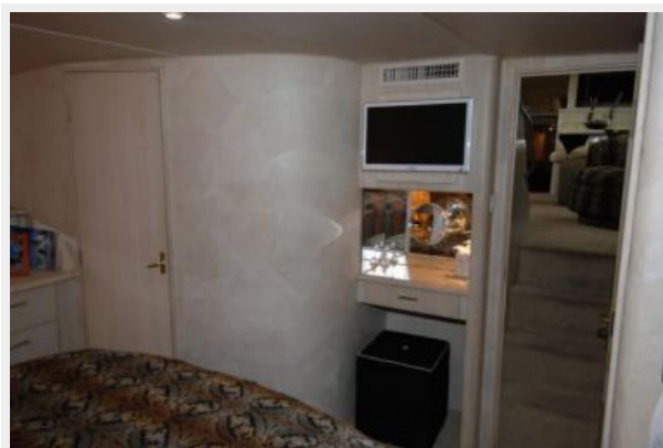
Master Stateroom showing TV and Vanity