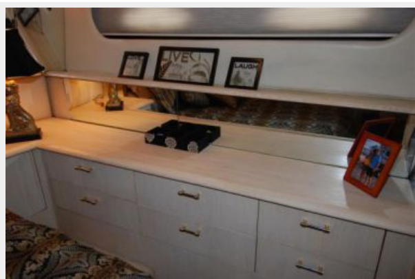
Master Stateroom Portside Dresser