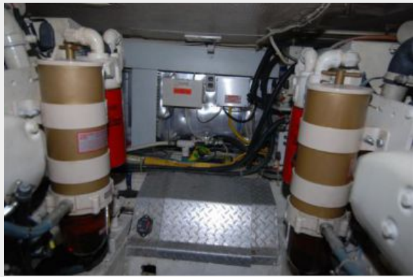
Engine Room looking forward