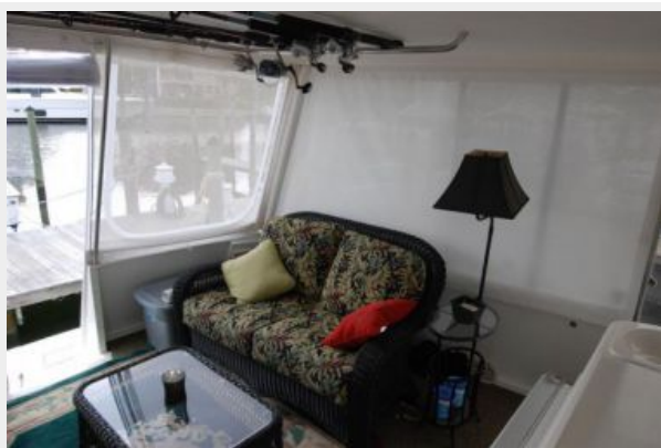
Aft Deck Port side