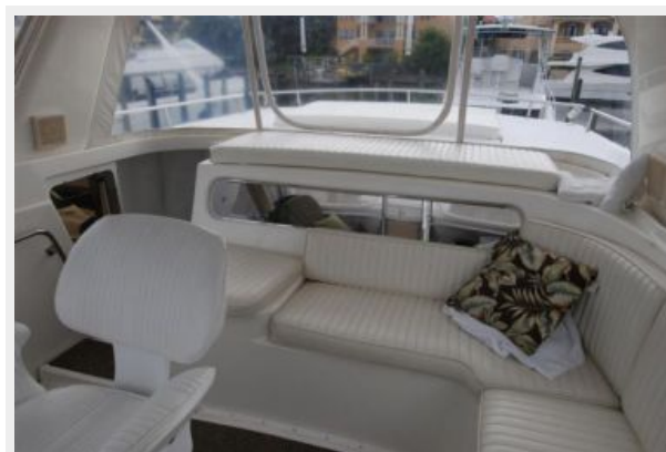
Bridge facing Aft