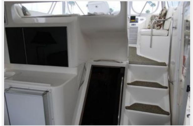
Aft Deck/Bridge Steps