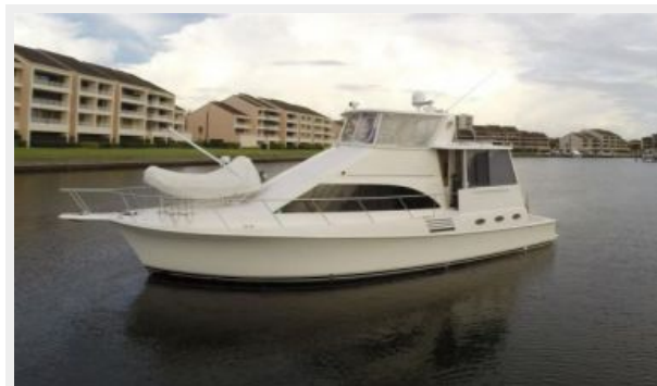
Port Profile (2)