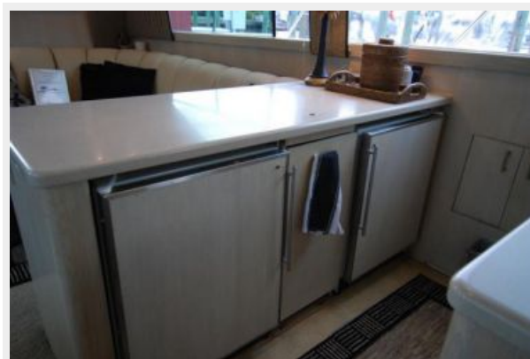
Galley Under Counter Refrigerator/Freezer