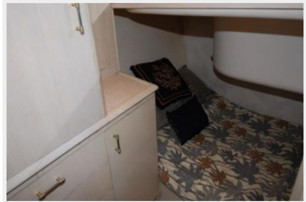
Mid Stateroom (2)