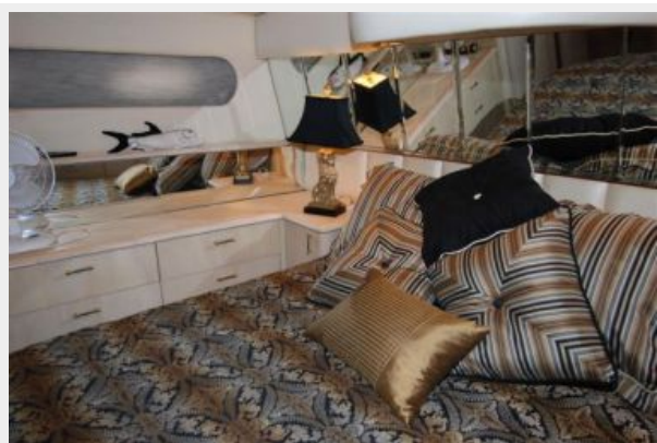
Master Stateroom facing aft