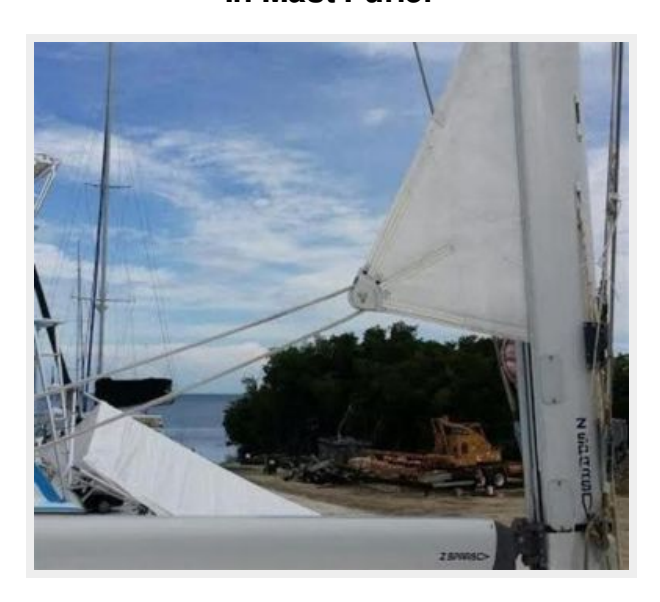
In Mast Furler