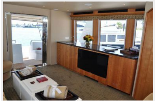
Salon Aft Port