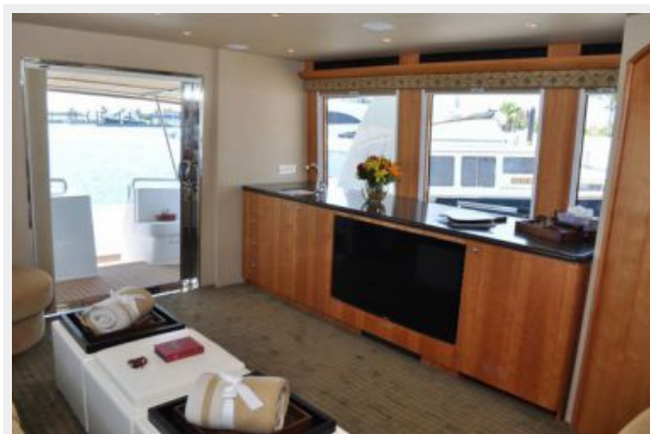
Salon Aft Port