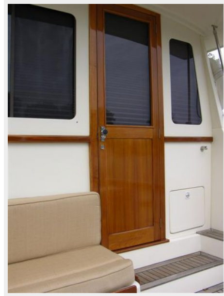
Pilot House L-Settee