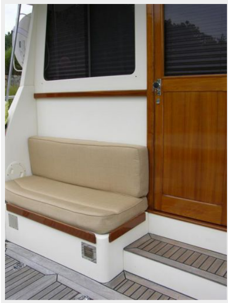
Aft Pilot House