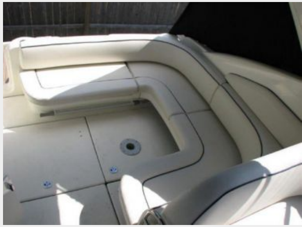
Deck 2 - Cockpit Seating