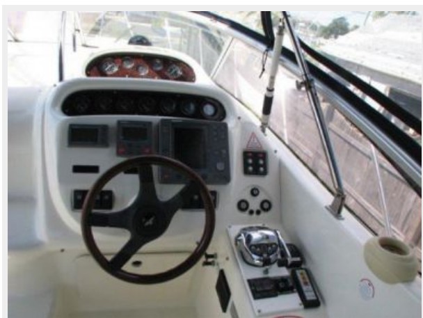
Helm / Electronics & Navigation