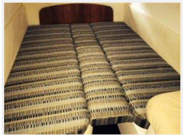
Guest Stateroom 2