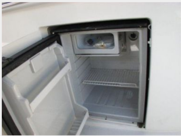
Deck 4 - Cockpit Refrigerator