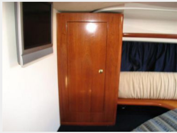
Master Stateroom 2