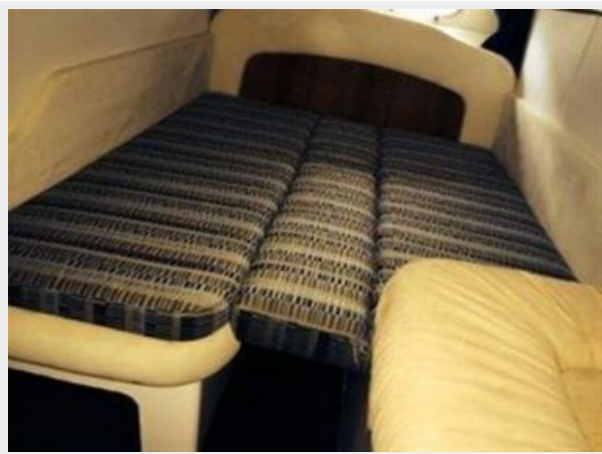
Guest Stateroom 1