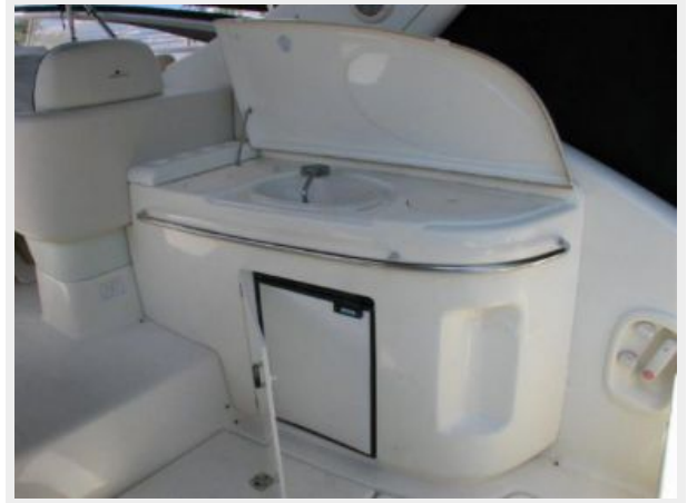
Deck 3 - Cockpit Wet Bar