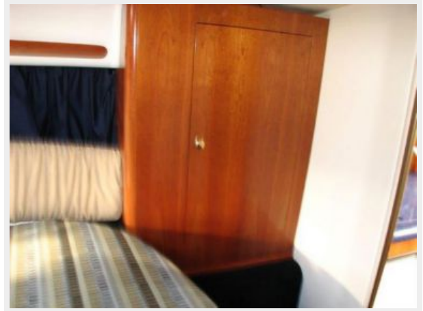
Master Stateroom 3