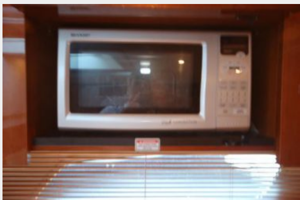
Galley Microwave / Convection Oven