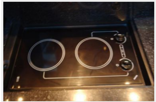
Kenyon Two Burner Stove