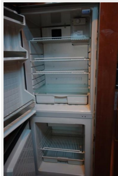
Galley Refrigerator / Freezer