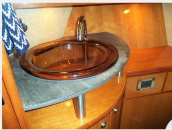
Guest head sink detail