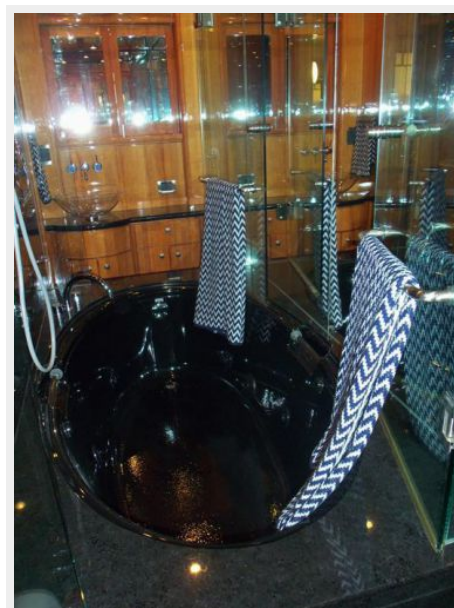
Centerline Master shower