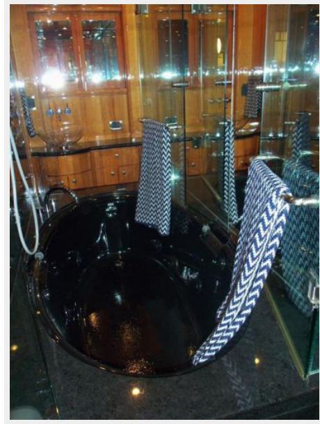
Centerline Master shower