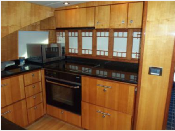
Galley with partition closed