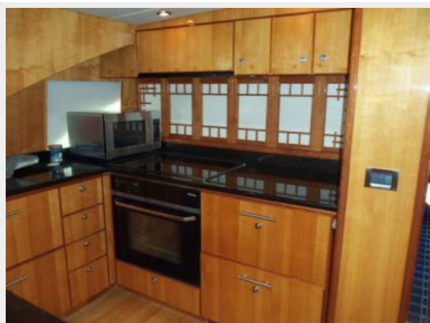
Galley with partition closed