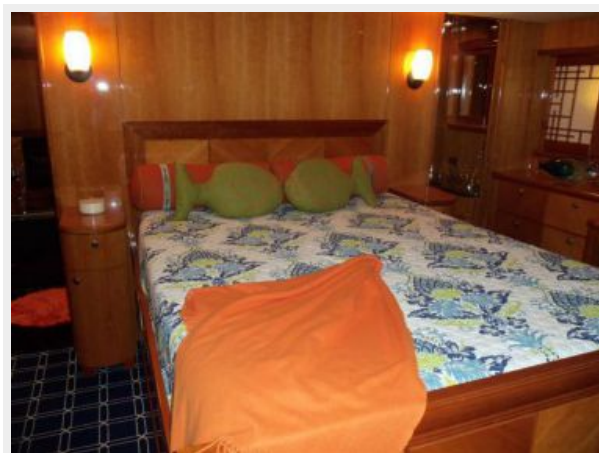
Master looking aft