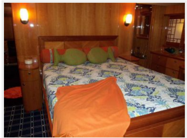
Master looking aft