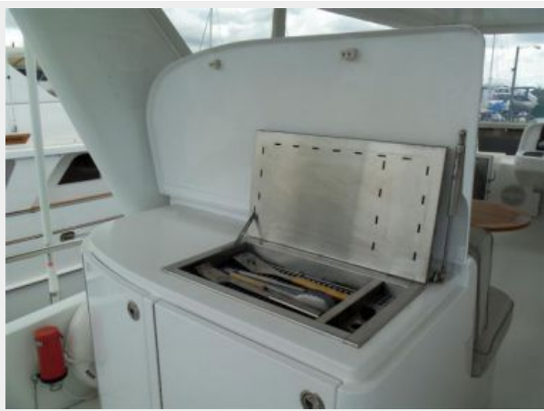
Boat Deck Grill