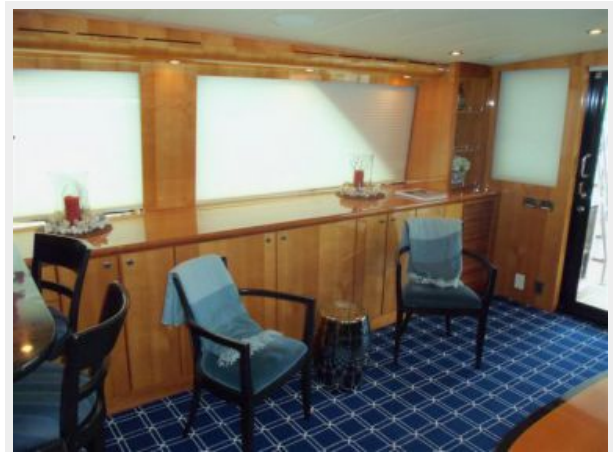
Salon to Starboard