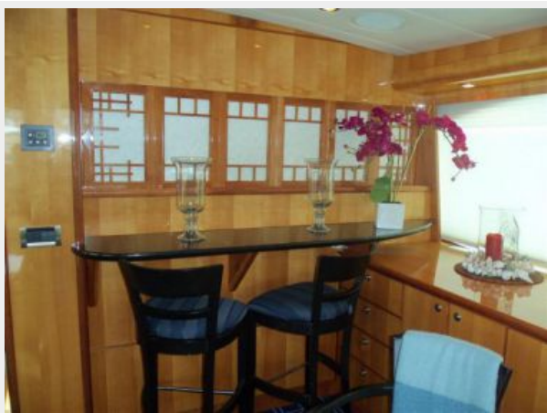
Salon bar area