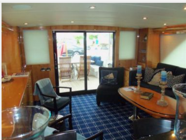
Salon looking aft