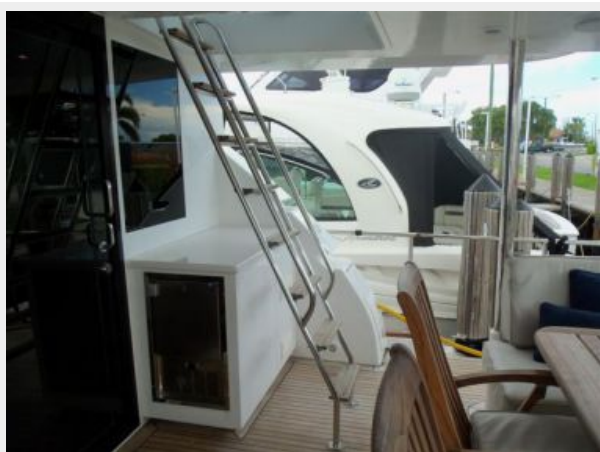
Aft Deck Flybridge Ladder