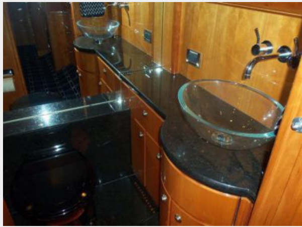
Portside master head