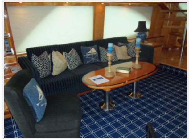
Salon looking port