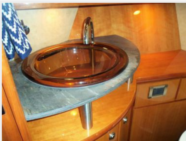
Guest head sink detail