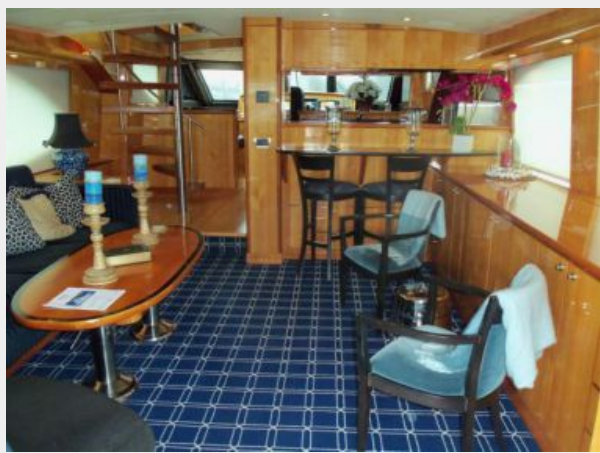
Salon looking forward