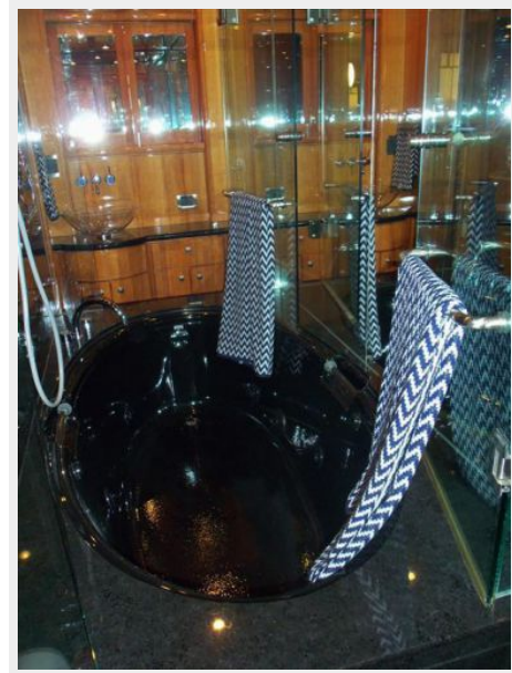
Centerline Master shower