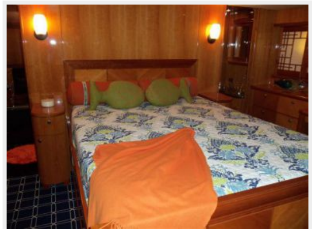
Master looking aft