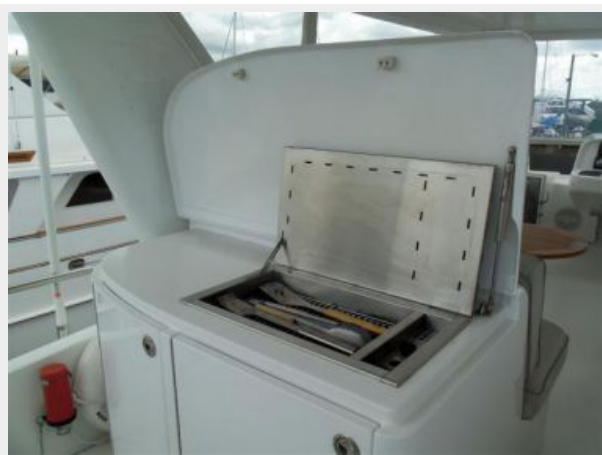
Boat Deck Grill