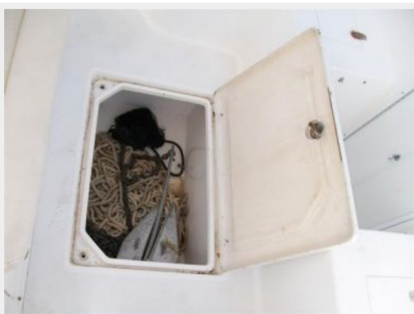
Forward fish box