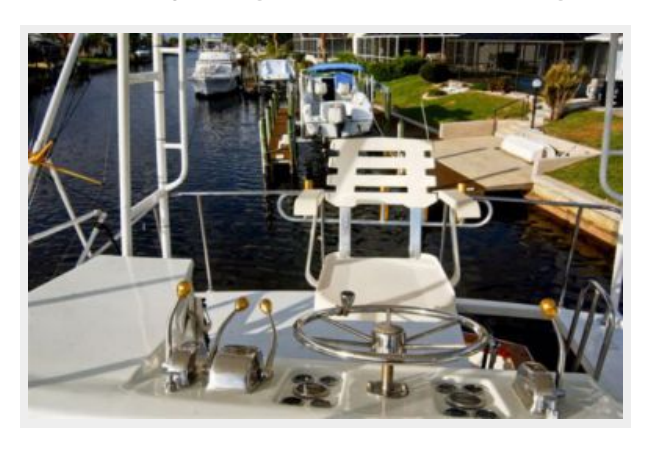
Full Flybridge w/forward seating