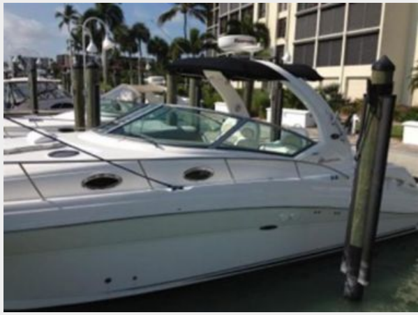
Port side with Radar arch