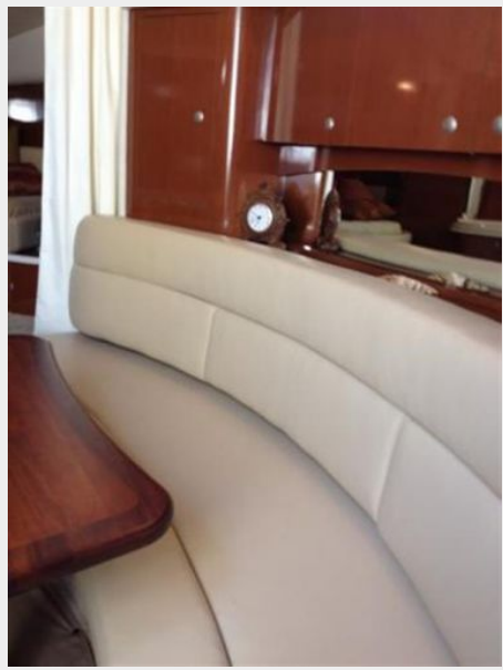
Starboard salon seating