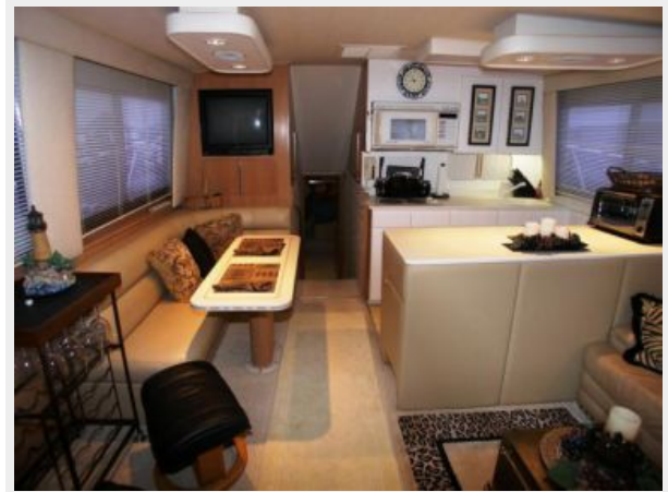
Saloon View Forward