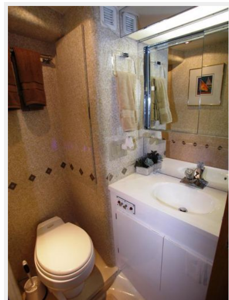
Master Stateroom Head