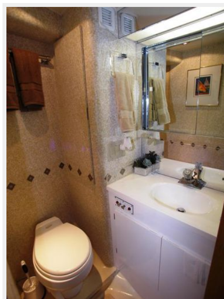
Master Stateroom Head