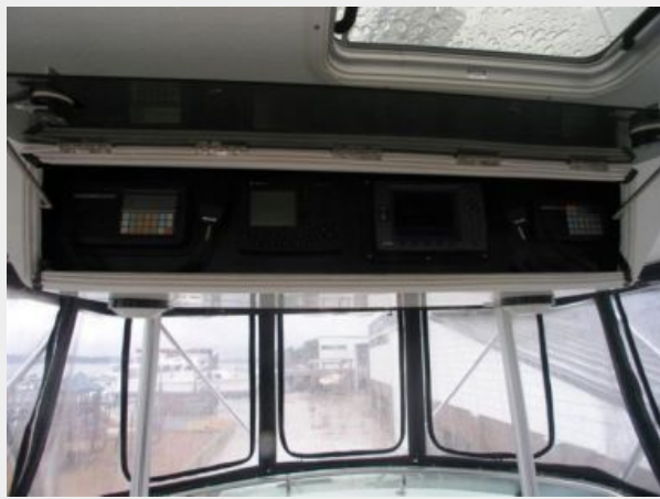
Flybridge Electronics Box