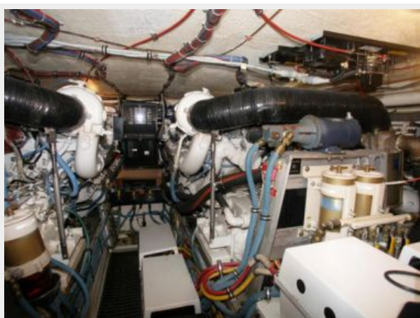
Main Stbd Engine