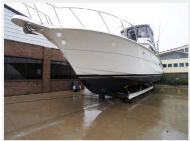
Fresh Water Finish