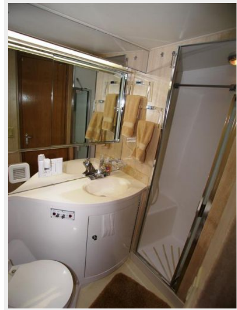
Guest Head Shower