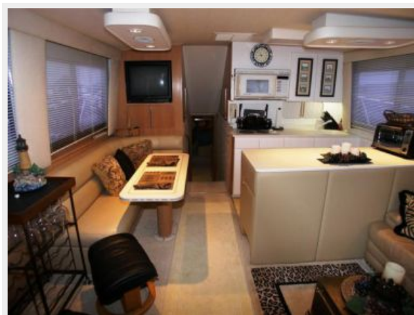
Saloon View Forward