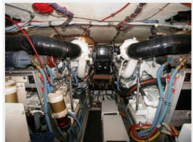
Engine Room View Forward