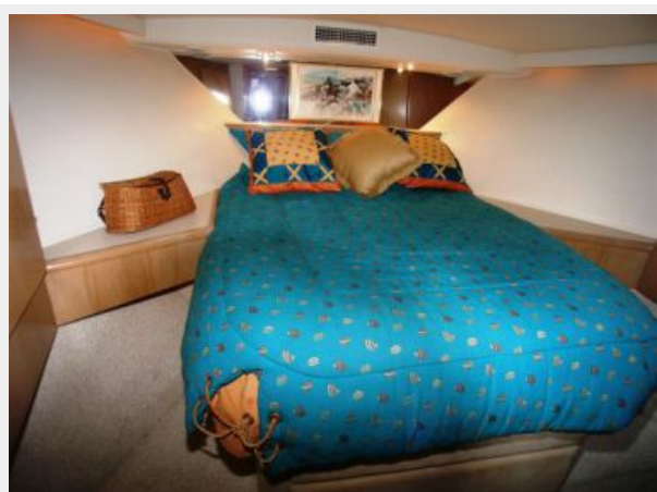
VIP Guest Stateroom