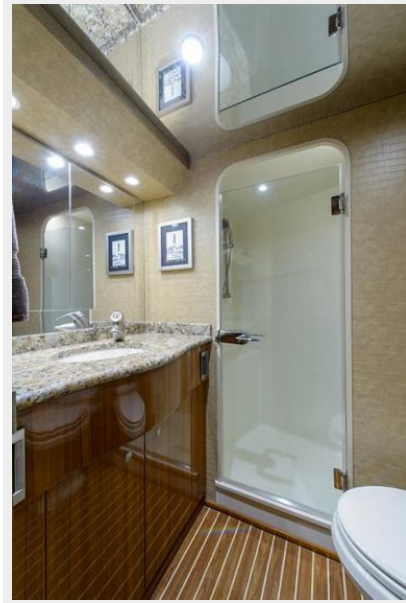
Forward Guest Stateroom Head