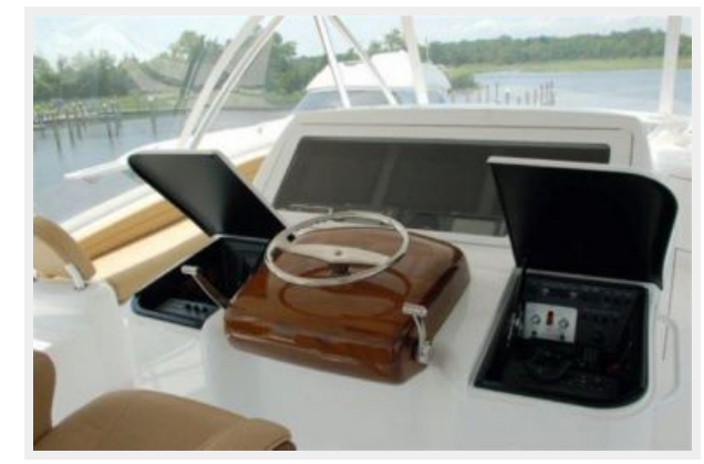
The min Looking Torward