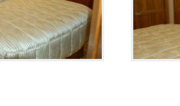
Master Stateroom Looking Forward