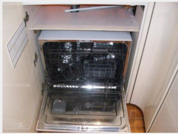
Stainless dish washer