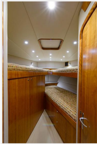
VIP Stateroom, Forward