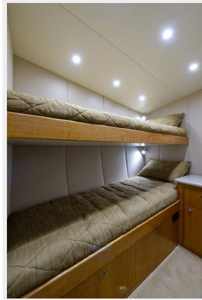
Guest Stateroom, Starboard