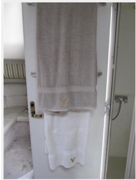
Door to Head