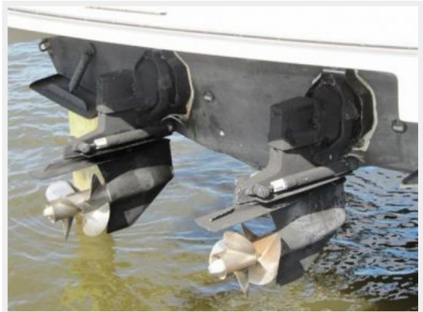
Out drives Trim Tabs