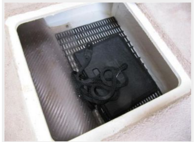
Below Deck Storage