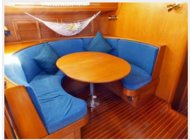
Main Salon Dinette Settee