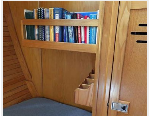
Library in Guest Quarters