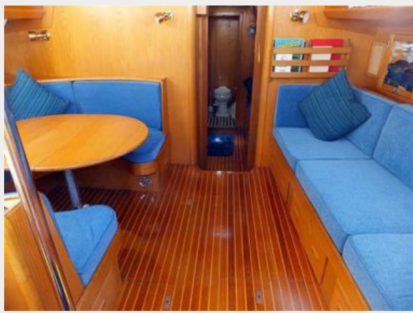
Main Salon Looking Forward