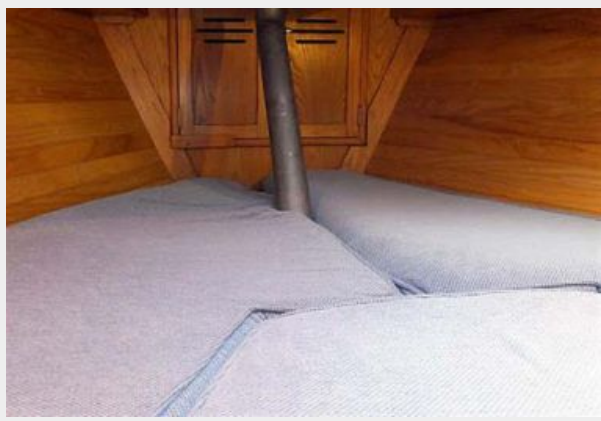
V-Berth Looking Forward