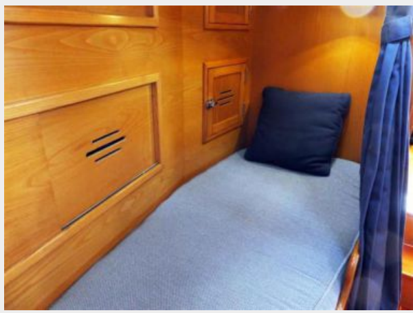
Starboard Berth in Guest Quarters