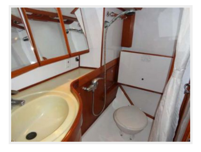
Forward Guest Head