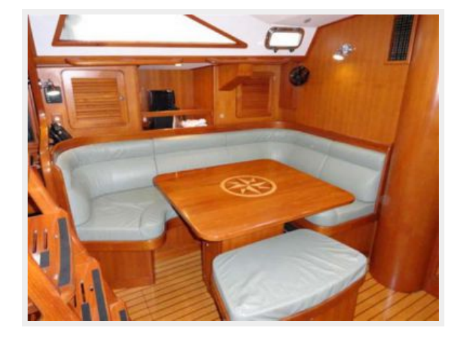
Main Salon, Looking Aft