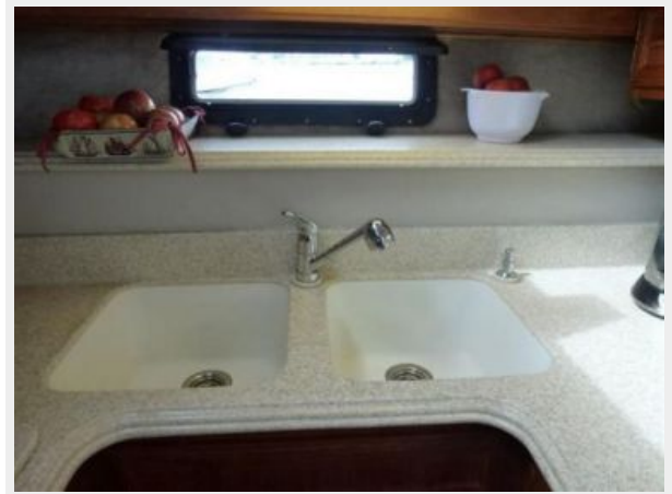
Galley - Sink