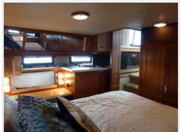
Aft Cabin 2