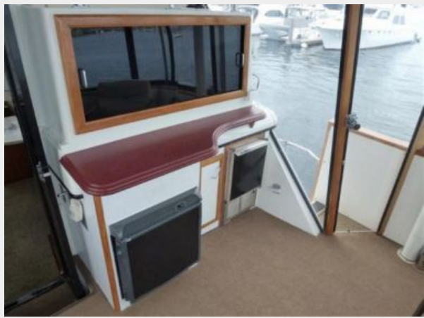
Aft Deck - Bar