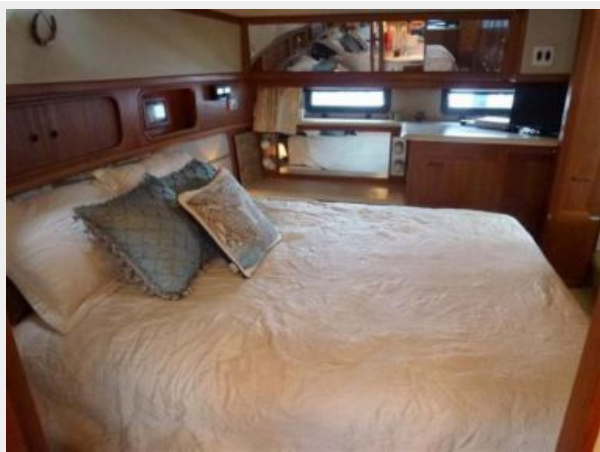
Aft Cabin bed