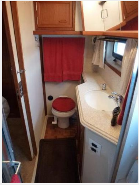
Aft Head 2