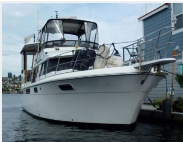
Port Bow (Docked)