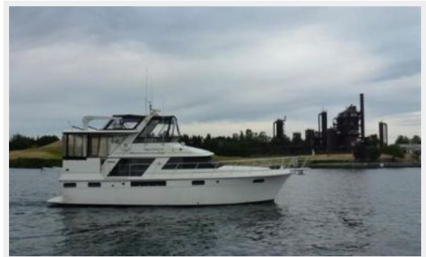
Starbord Side (Underway)