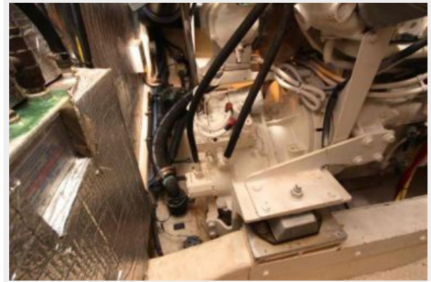
Port Marine Gear