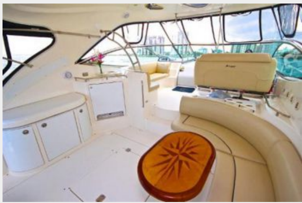
Cockpit Forward Looking Overview