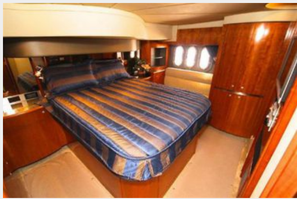
Master Queen Berth