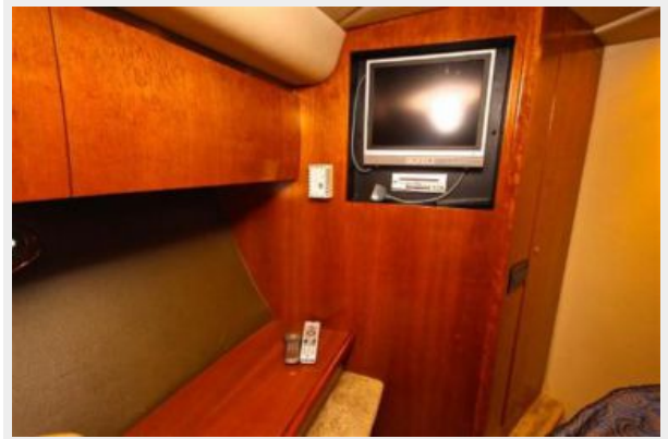
Guest Stateroom TV