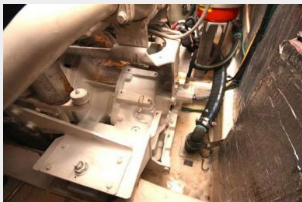
Starboard Marine Gear