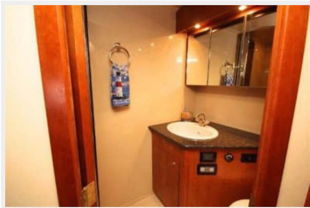
Master Head Vanity