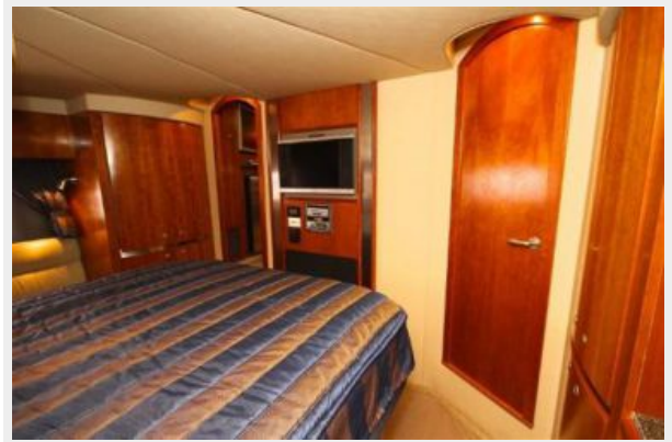
Master Looking Forward